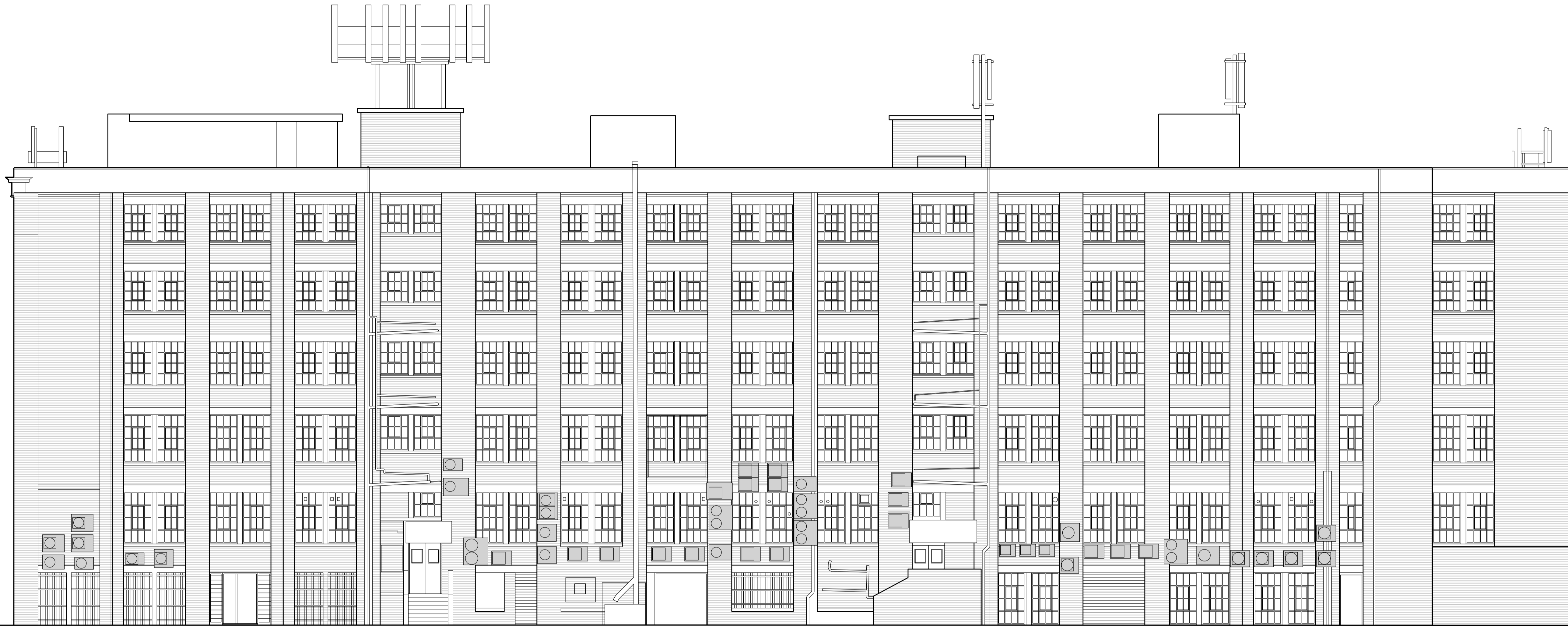
1 West elevation as existing 152_032 Scale 1:100 @ A1