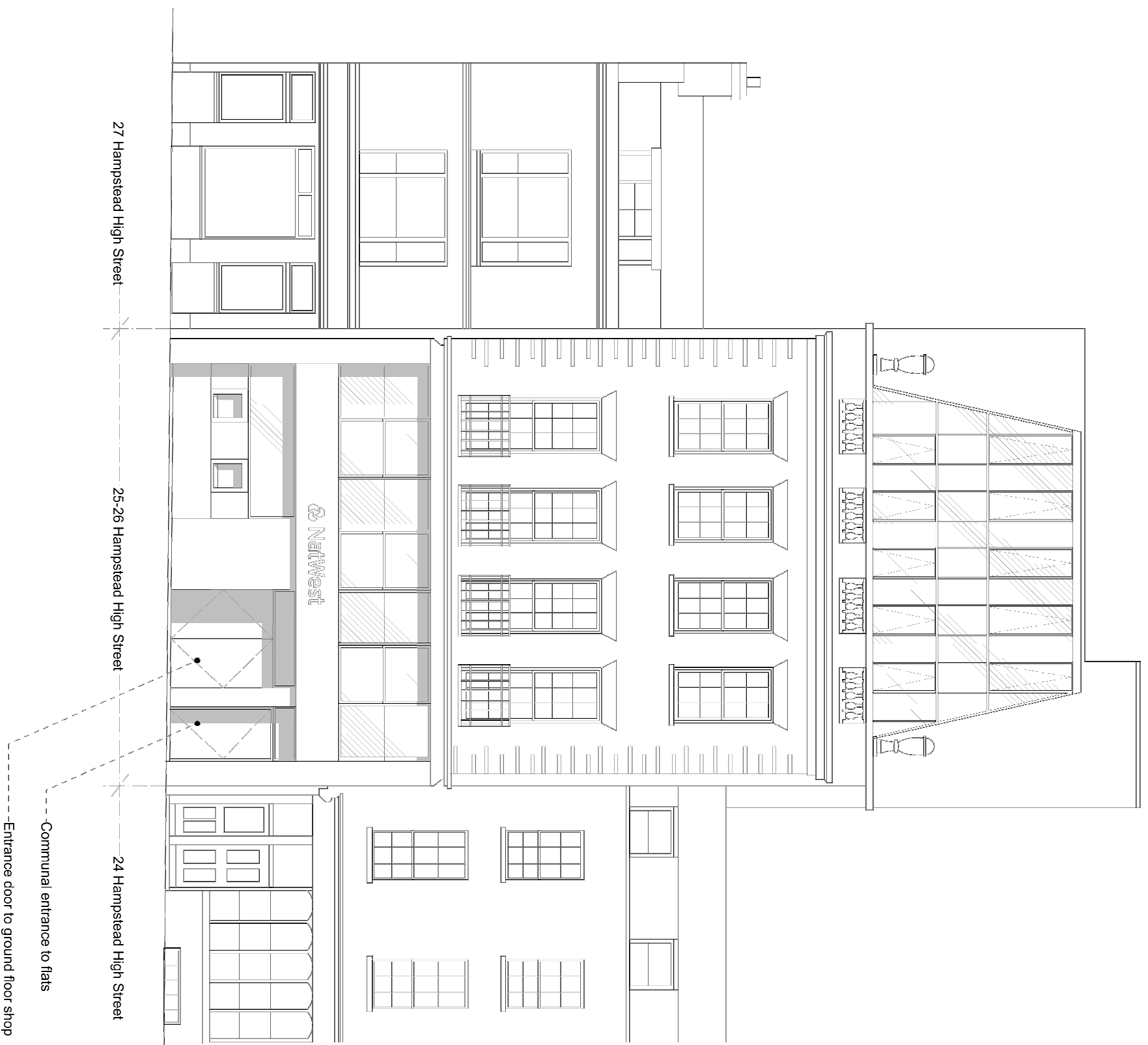
Front elevation on High Street 1:100

Use figured dimensions only. All dimensions are to be checked on site and any discrepancies, errors or omissions are to be reported to the architect prior to commencement of works.