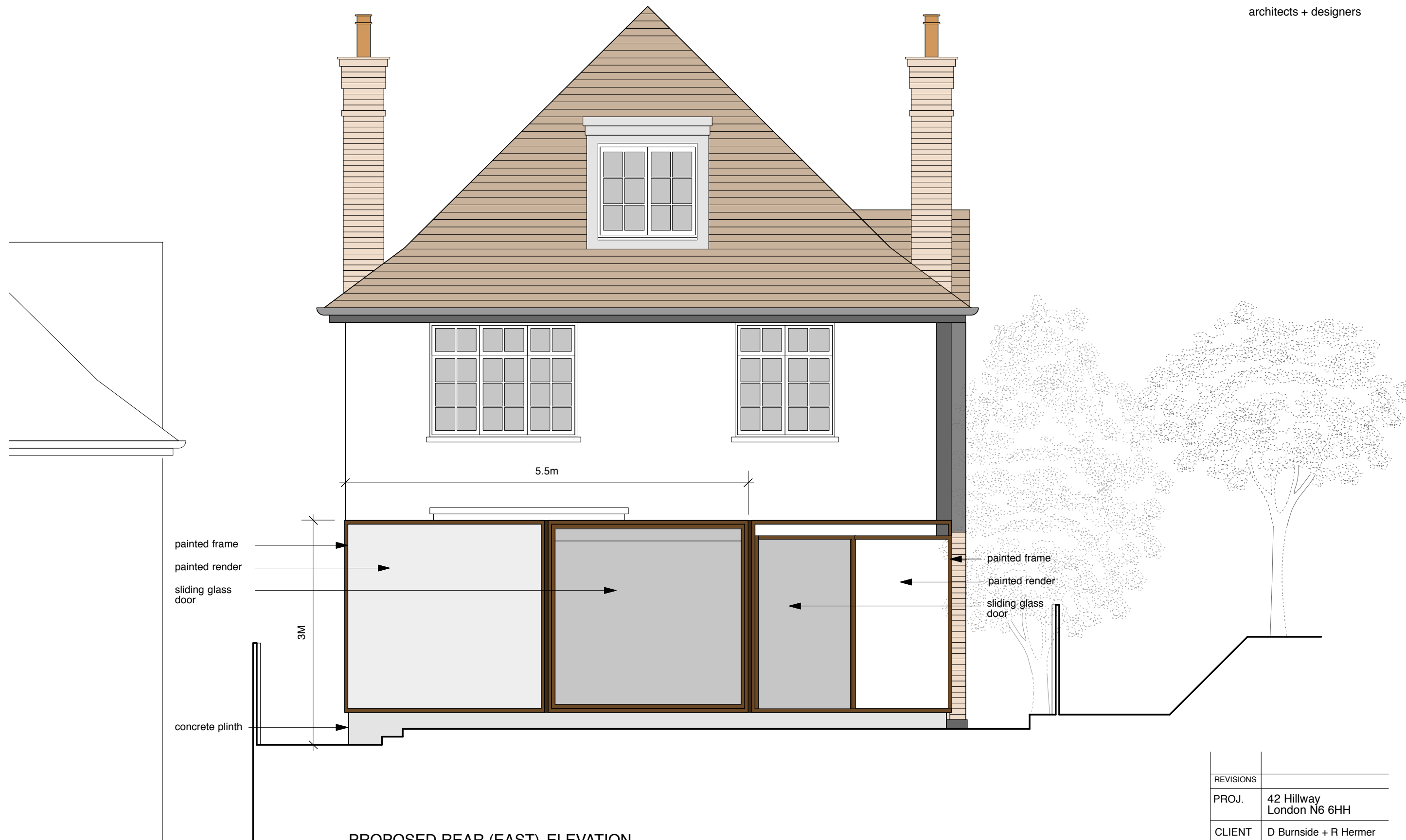
PROPOSED REAR (EAST) ELEVATION