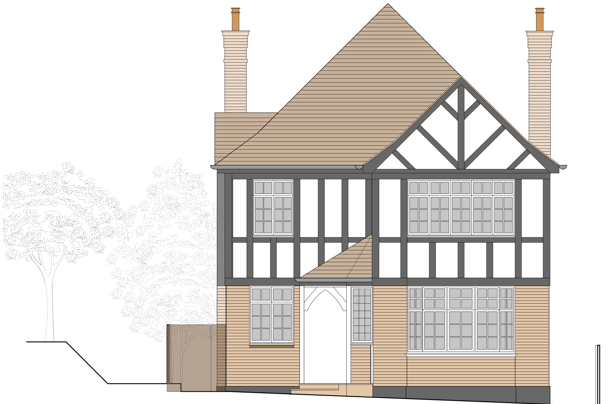
EXISTING FRONT(WEST) ELEVATION