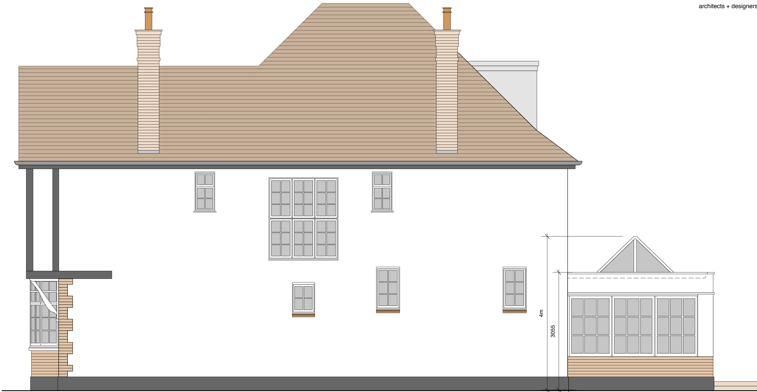
EXISTING SIDE ELEVATION (SOUTH)