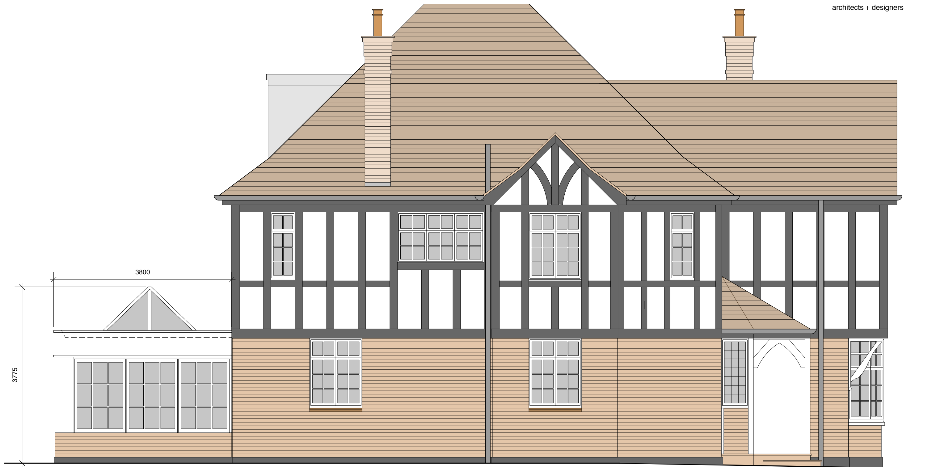
EXISTING SIDE ELEVATION (NORTH)