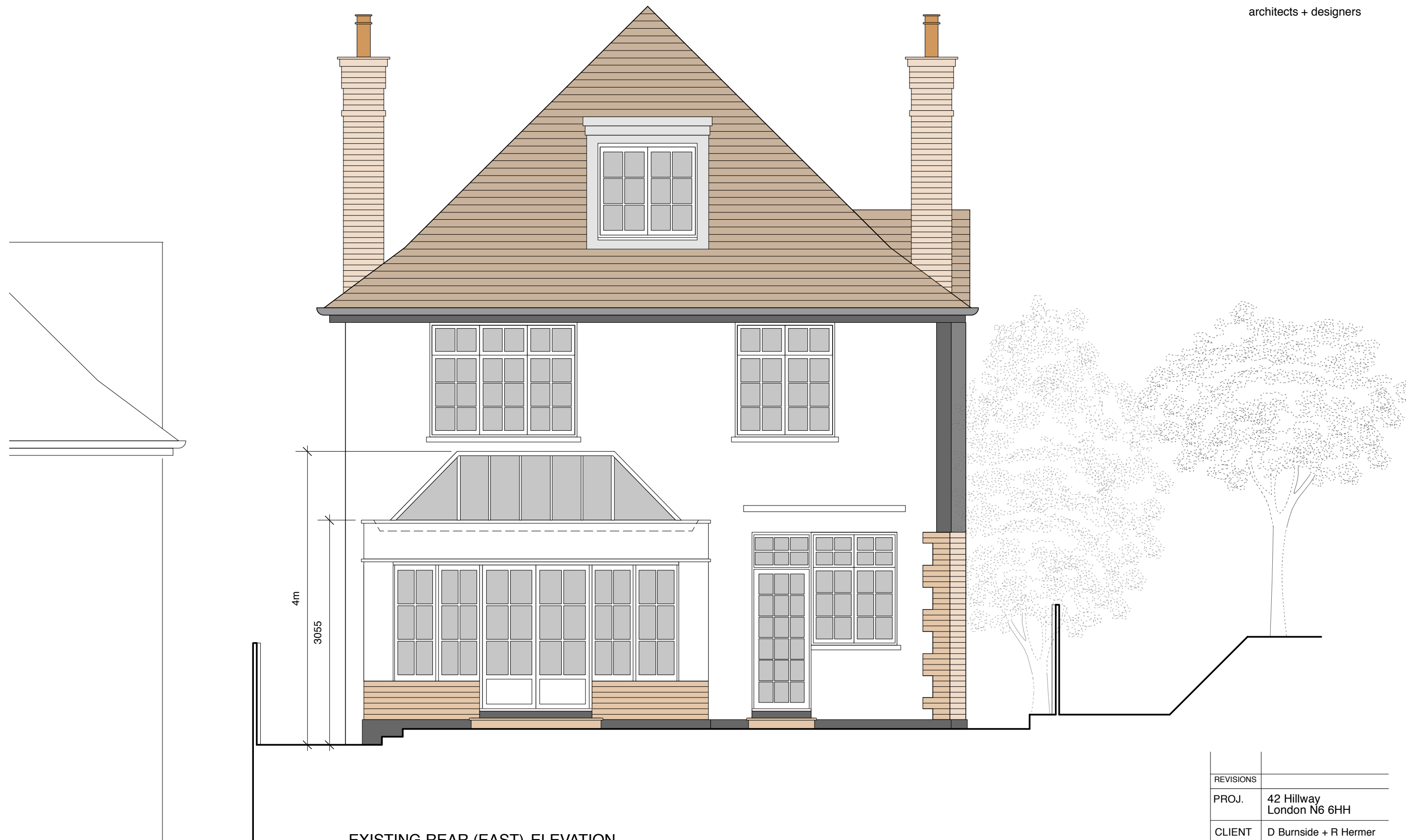
EXISTING REAR (EAST) ELEVATION