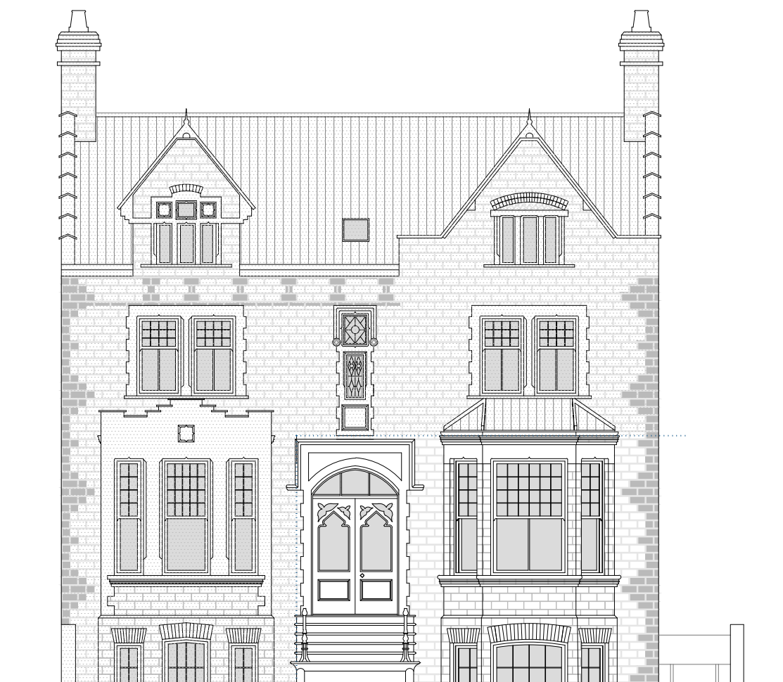
Existing Front Elevation 1:100 @A3