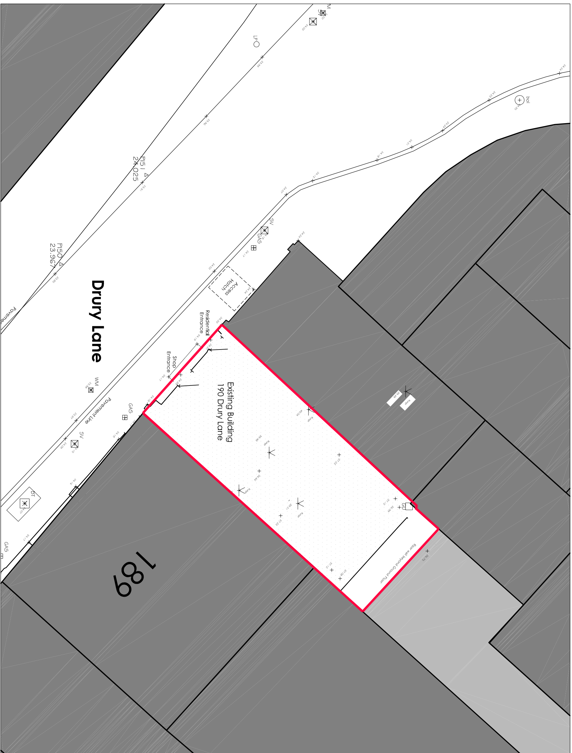
Existing Site Plan Scale 1:100 @ A3