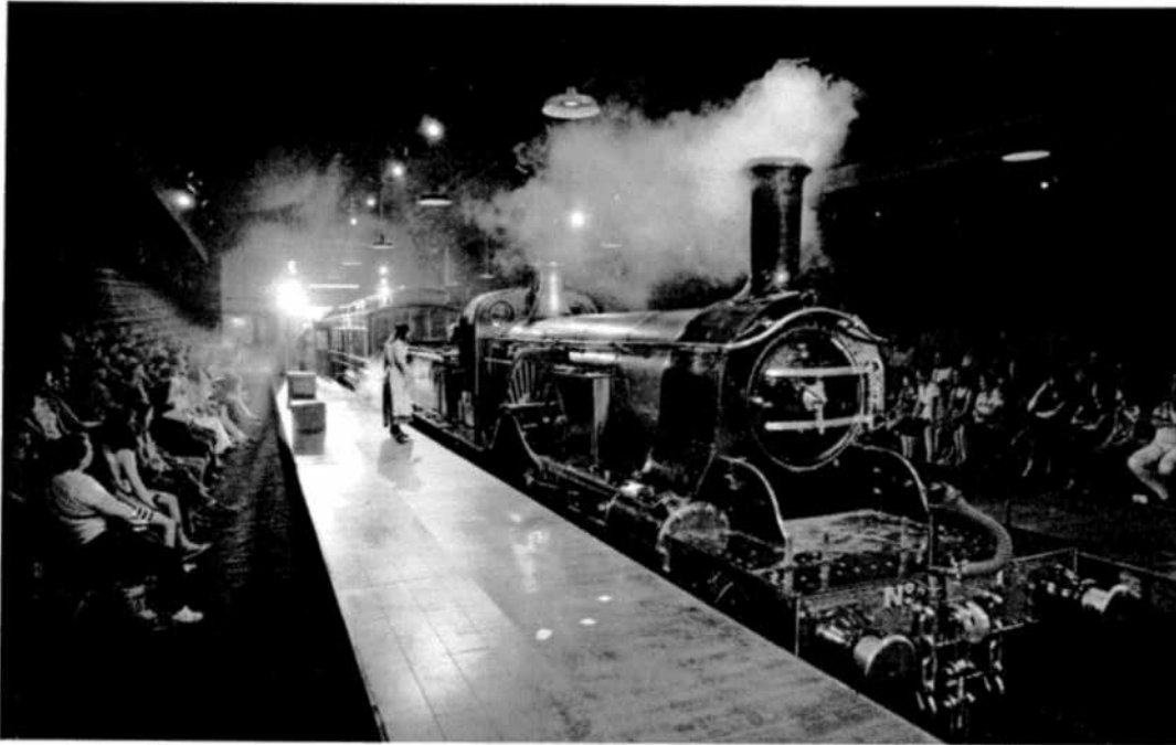
The Railway Children, Waterloo Station, 2010

Working with an expert production team, the producers aim to recreate the same success that they had at Waterloo, transforming an area of the newly refurbished landmark station at Kings Cross into a hub of activity, creating a magical theatrical event for both adults and children alike.