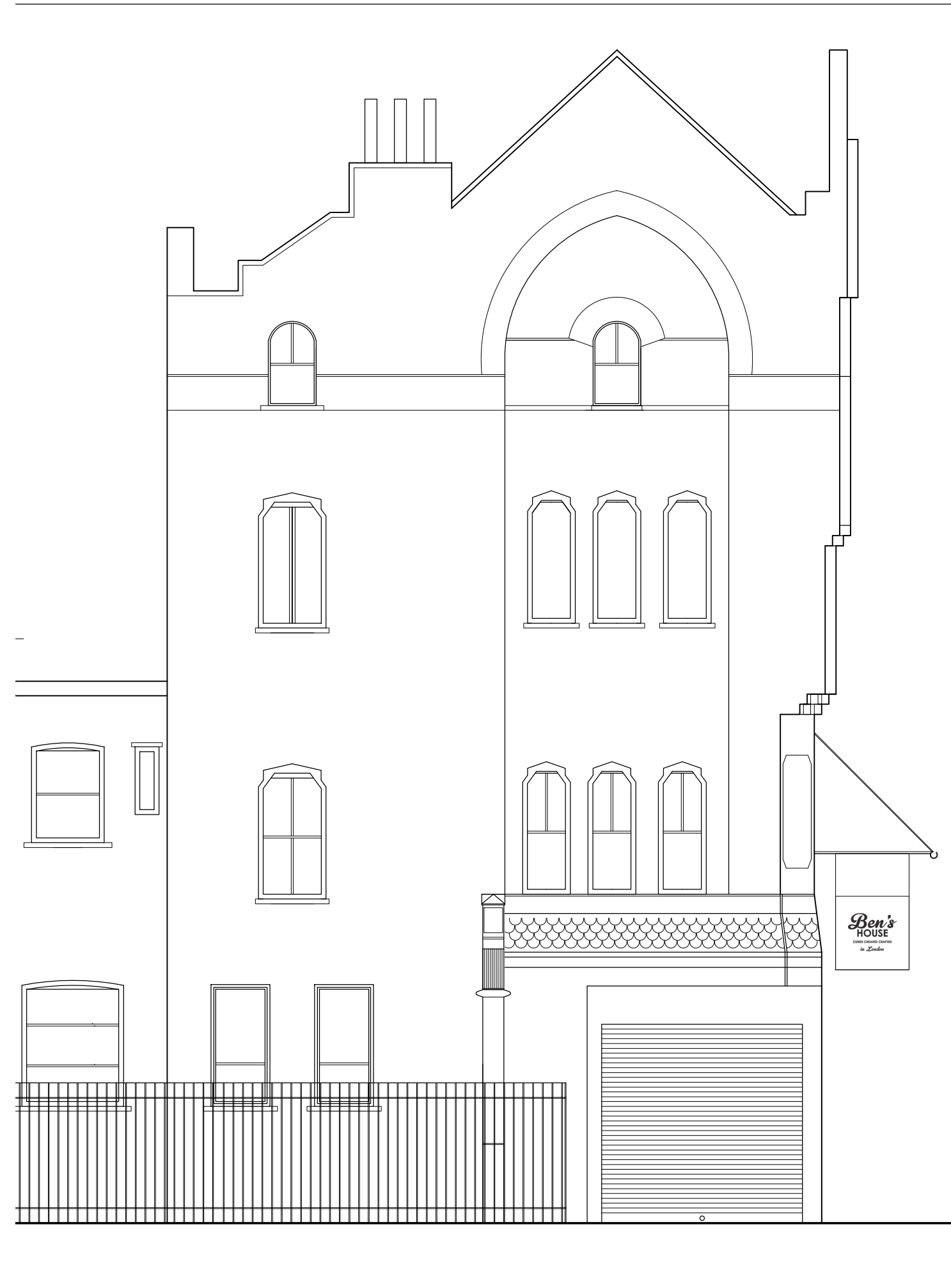
01 PROPOSED ELEVATION A-A 1:50@A3