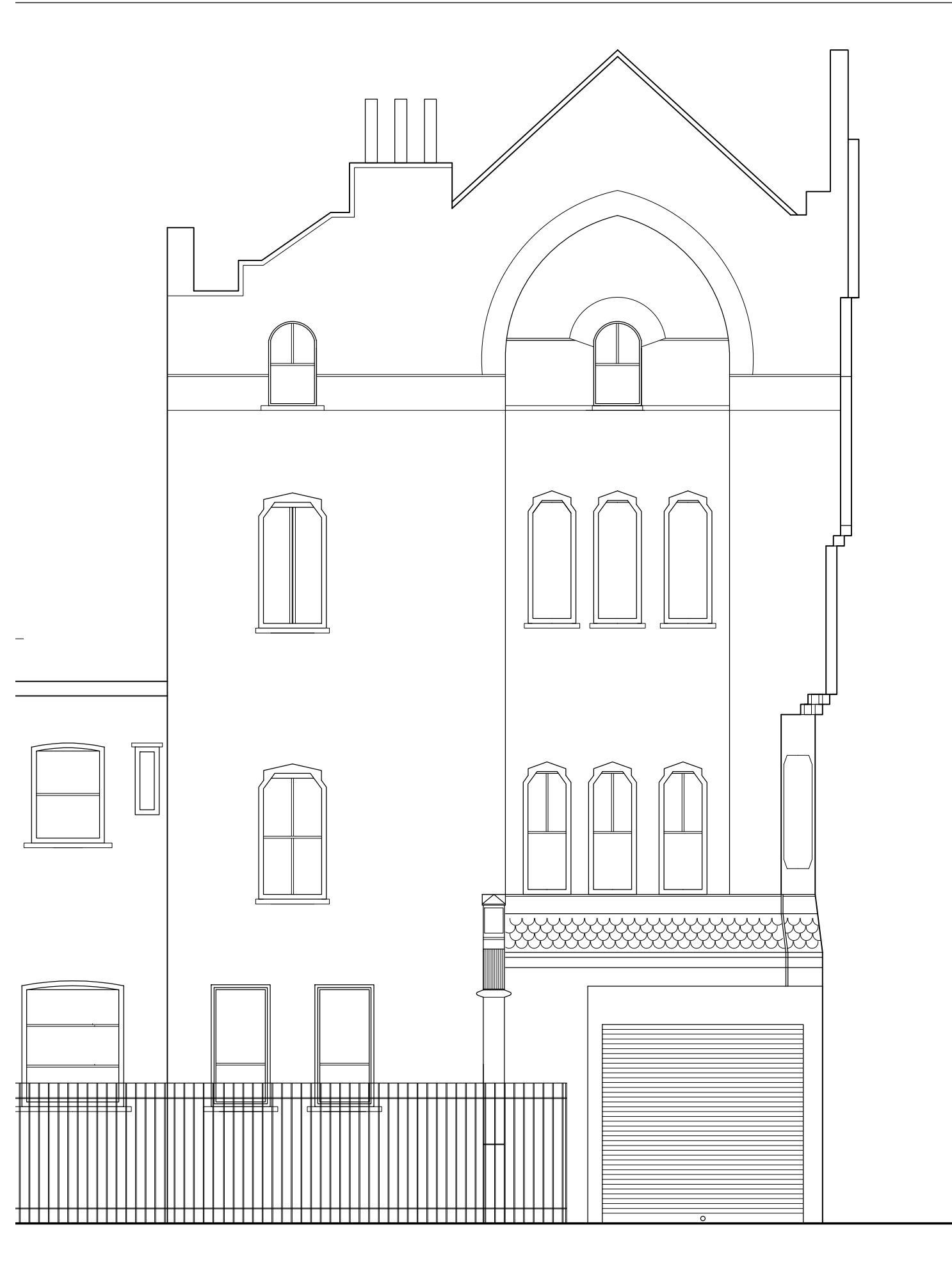
01 EXISTING ELEVATION A-A 1:50@A3