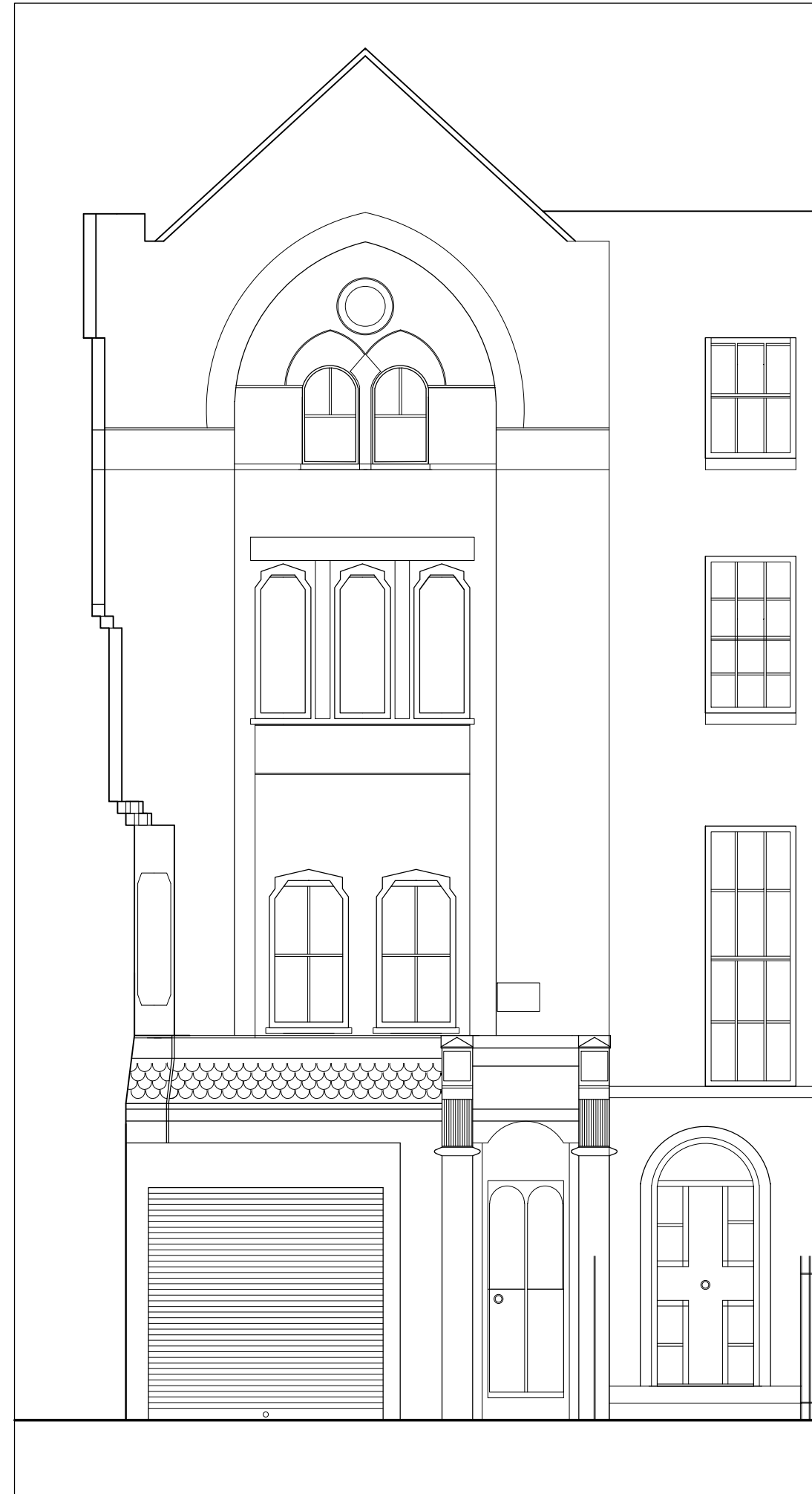
02 EXISTING ELEVATION B-B 1:50@A3