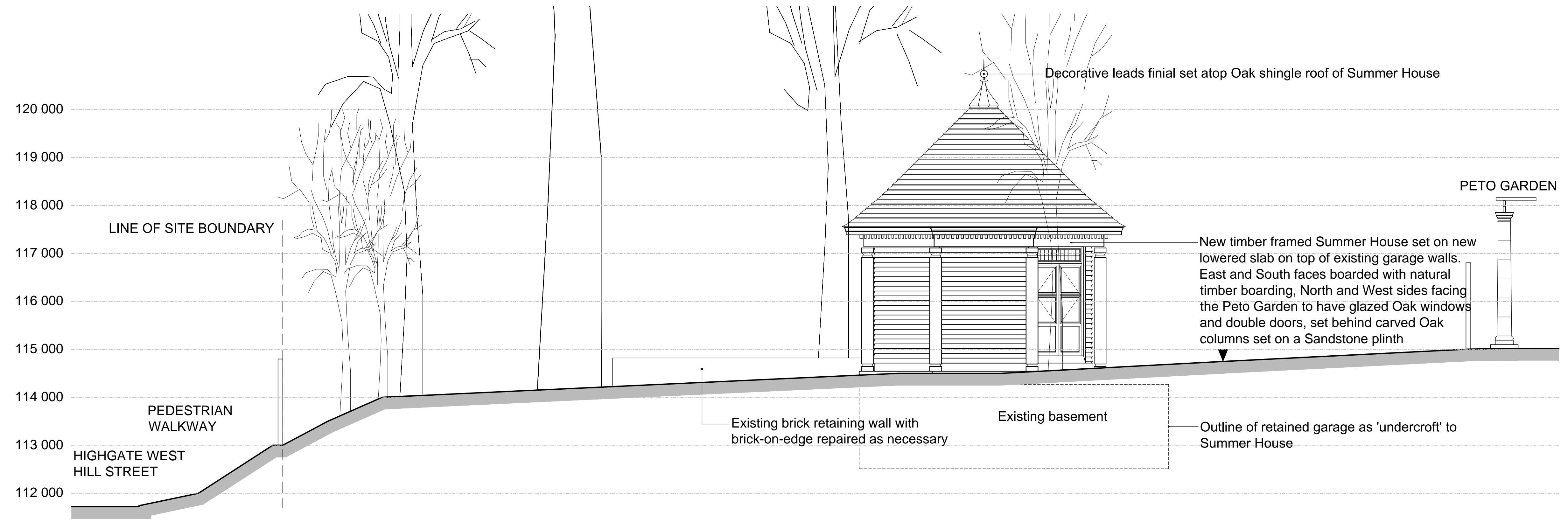
EAST ELEVATION AS PROPOSED SCALE 1:50