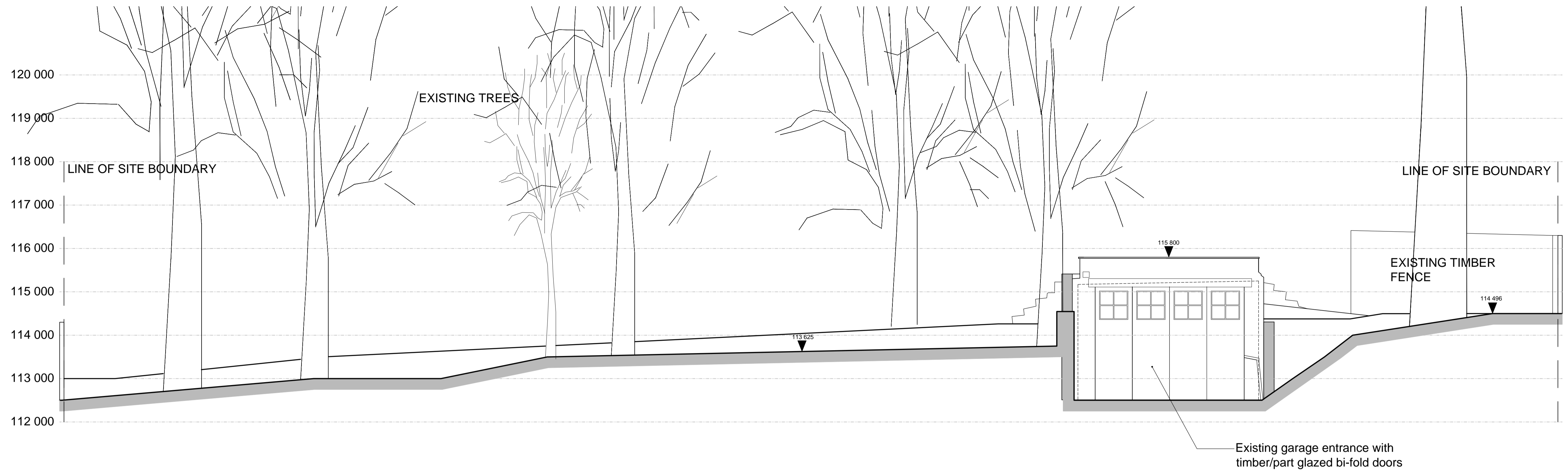
SOUTH ELEVATION AS EXISTING SCALE 1:50