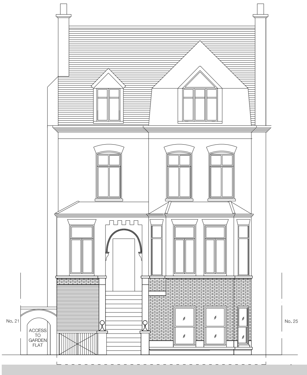
02 EXISTING FRONT ELEVATION 1 scale - 1:100 @ A3