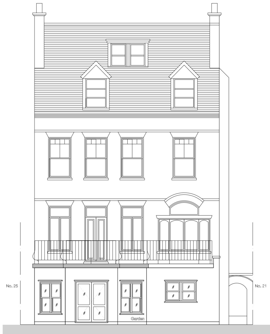
03 EXISTING REAR ELEVATION 3 scale - 1:100 @ A3