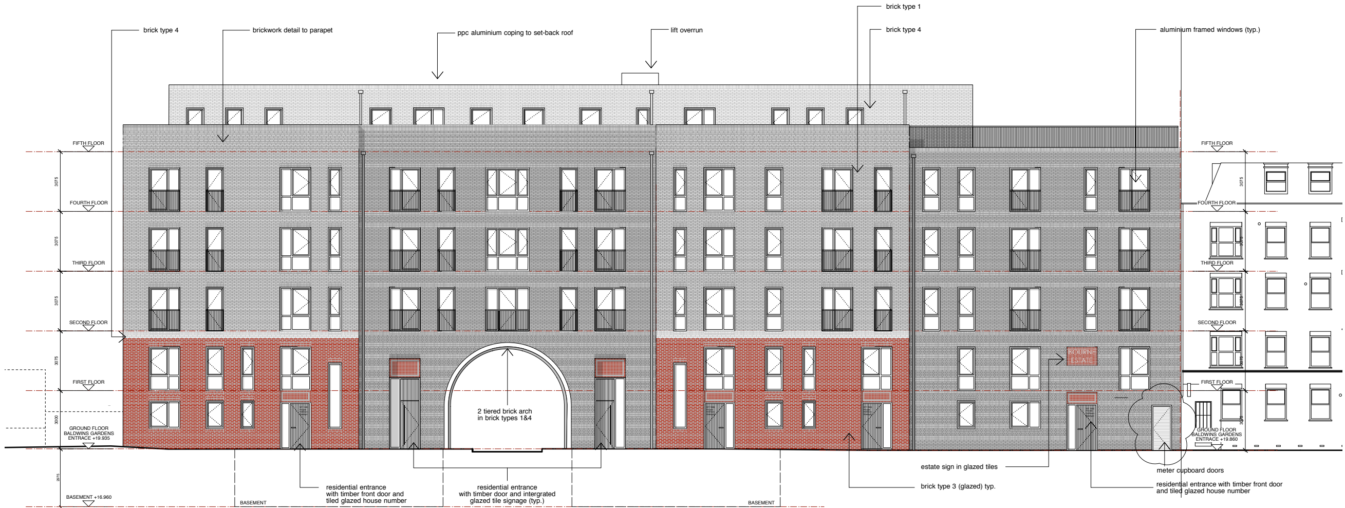
Proposed Block 2 Elevation D - Baldwins Gardens - 1:100 @A1