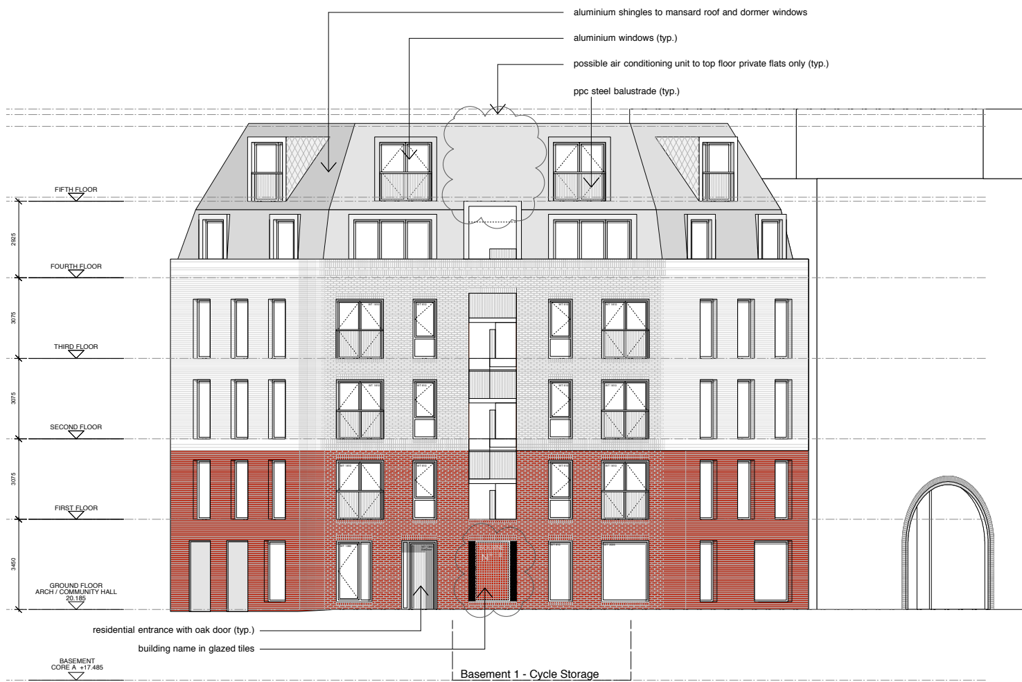
Proposed Block 1 Elevation B - 1:100 @A1