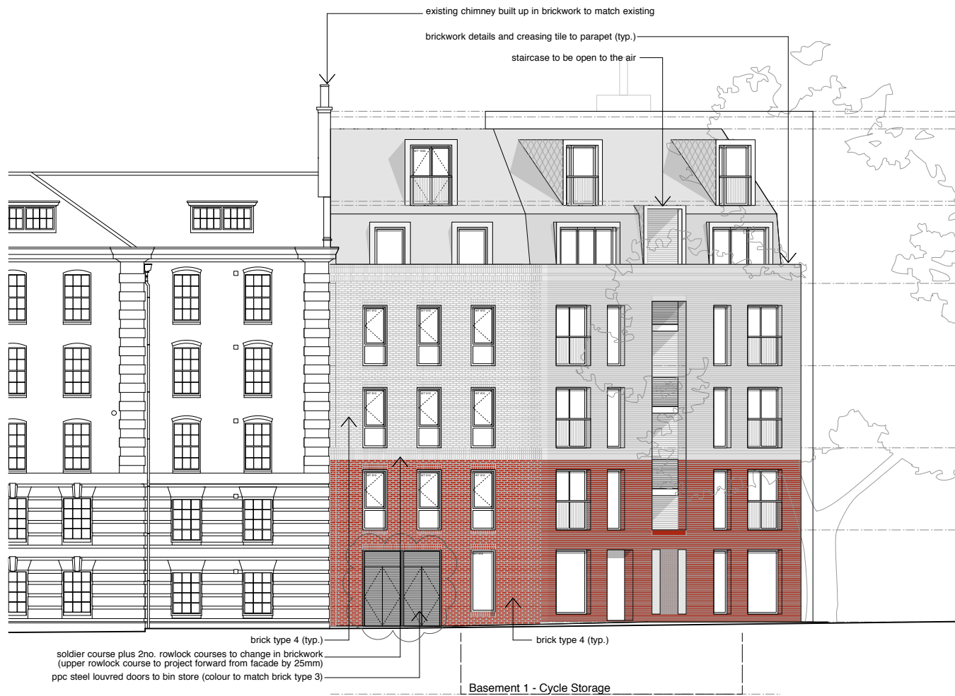
Proposed Block 1 Elevation A - 1:100 @A1