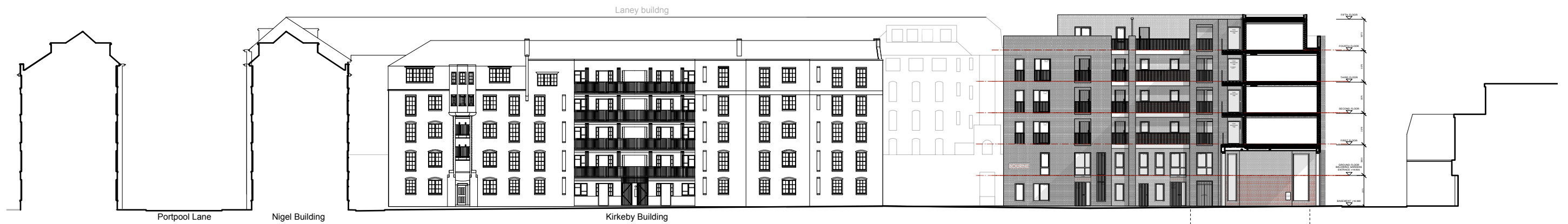
Proposed Block 2 Section 8 - 1:200@A1