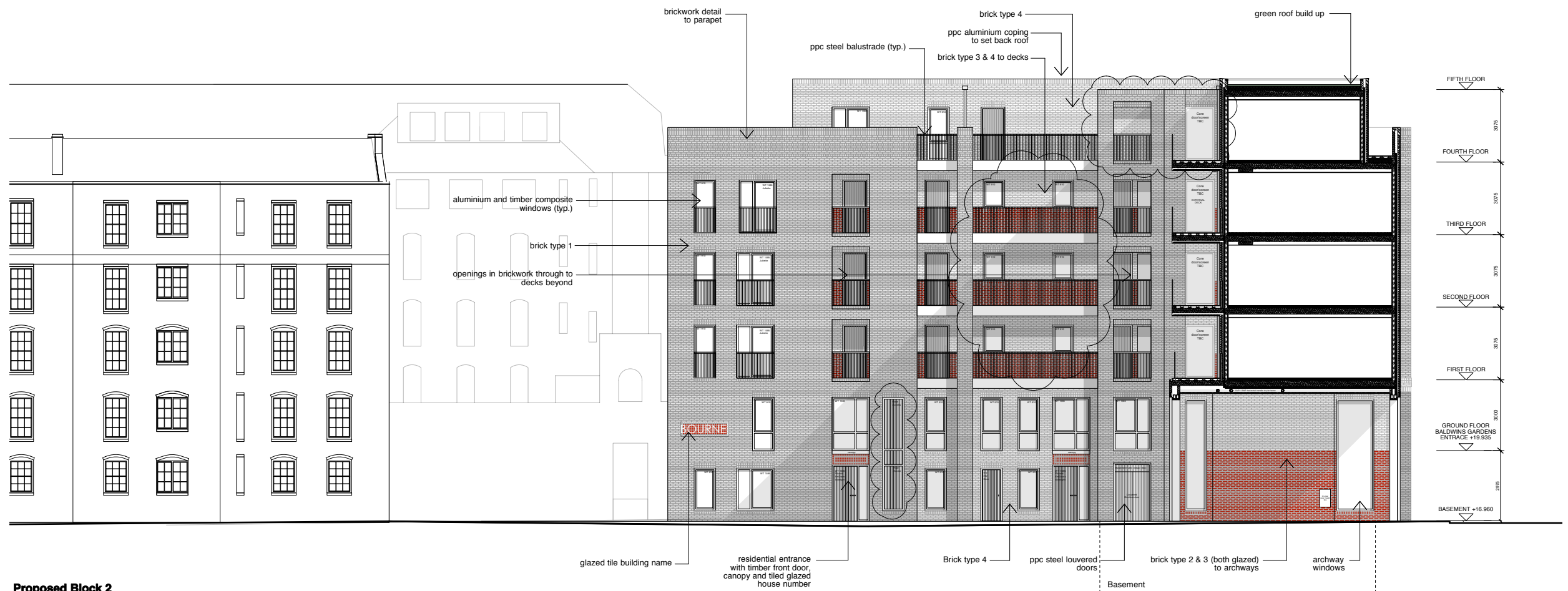
Proposed Block 2 Section 8 - 1:100 @A1