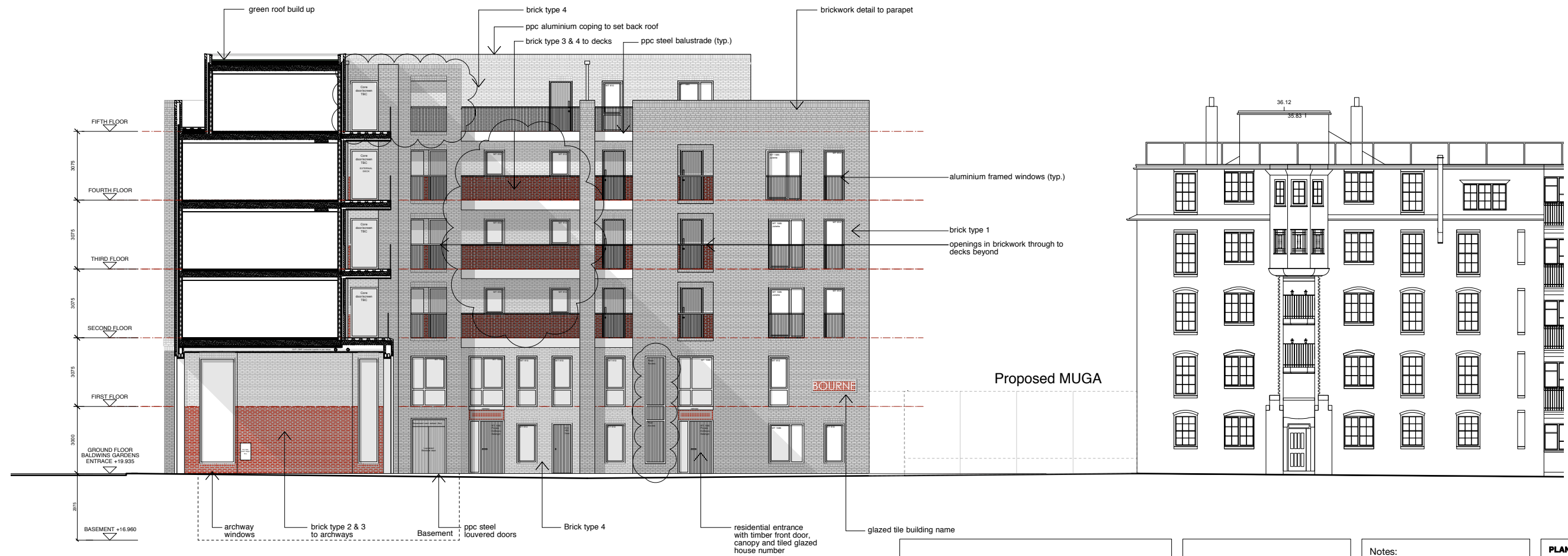
Proposed Block 2 Section 7 - 1:100 @A1