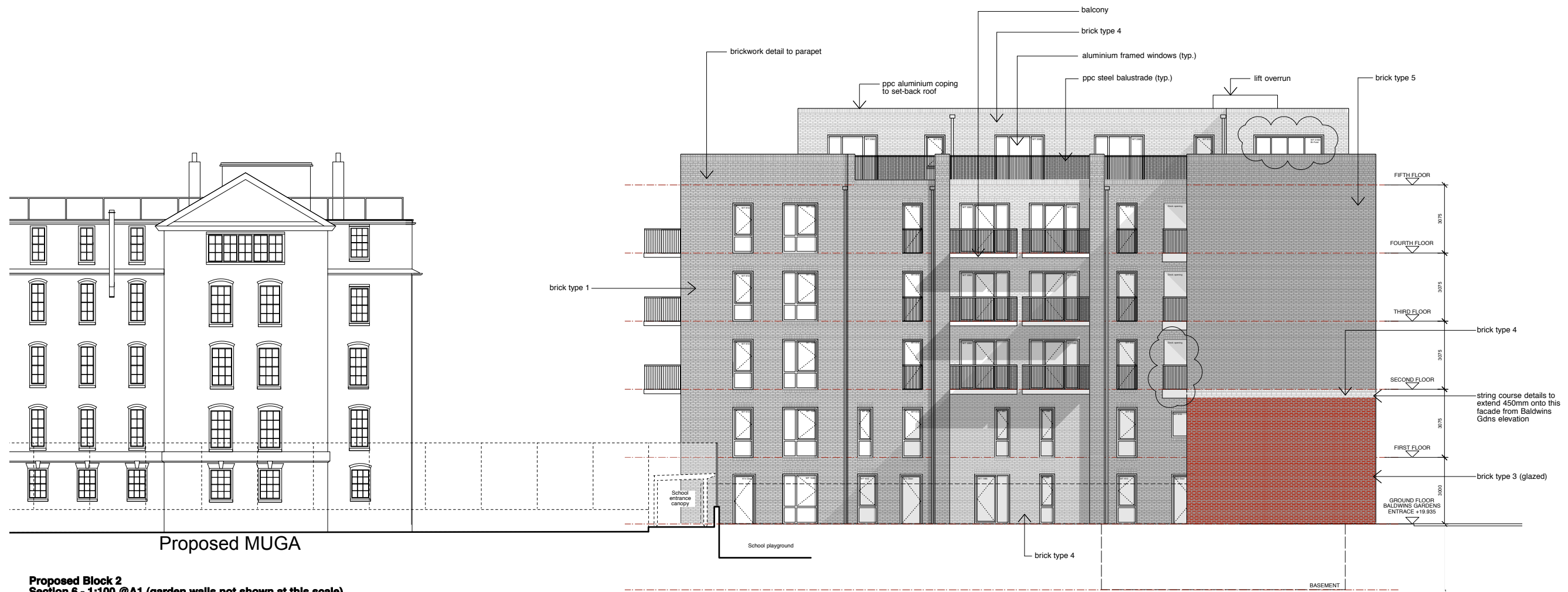
Proposed Block 2 Section 6 - 1:100 @A1 (garden walls not shown at this scale)