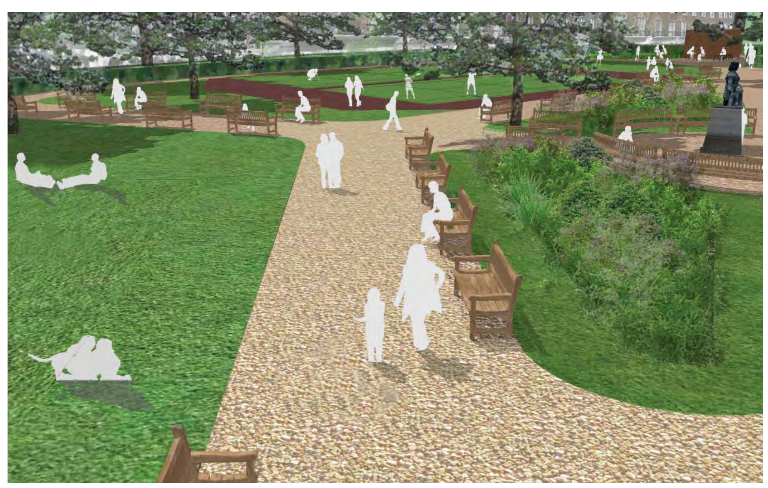
VIEWPOINT 2 - PROPOSED PATH THROUGH GARDENS TOWARDS MAIN PATH, WITH PLANTING BEDS

1488.P111 - CARTWRIGHT GARDENS COMMUNITY USE Title: Project: Garden Halls Date: April 2013