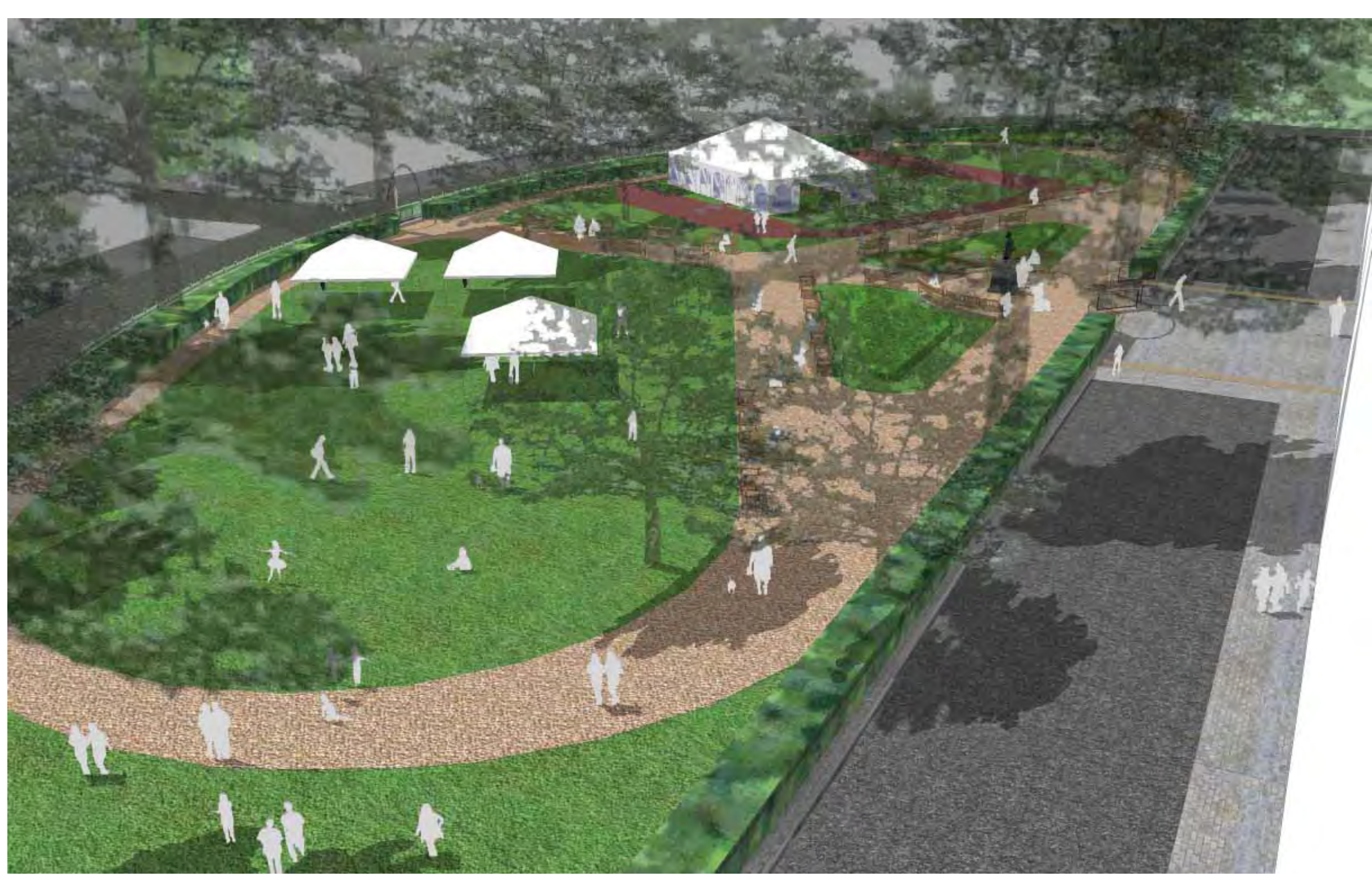
VIEWPOINT 3 - POTENTIAL EVENTS AREA FROM CORNER OF MARCHMONT ST & CARTWRIGHT GARDENS

1488.P111 - CARTWRIGHT GARDENS COMMUNITY USE Title: Project: Garden Halls Date: April 2013