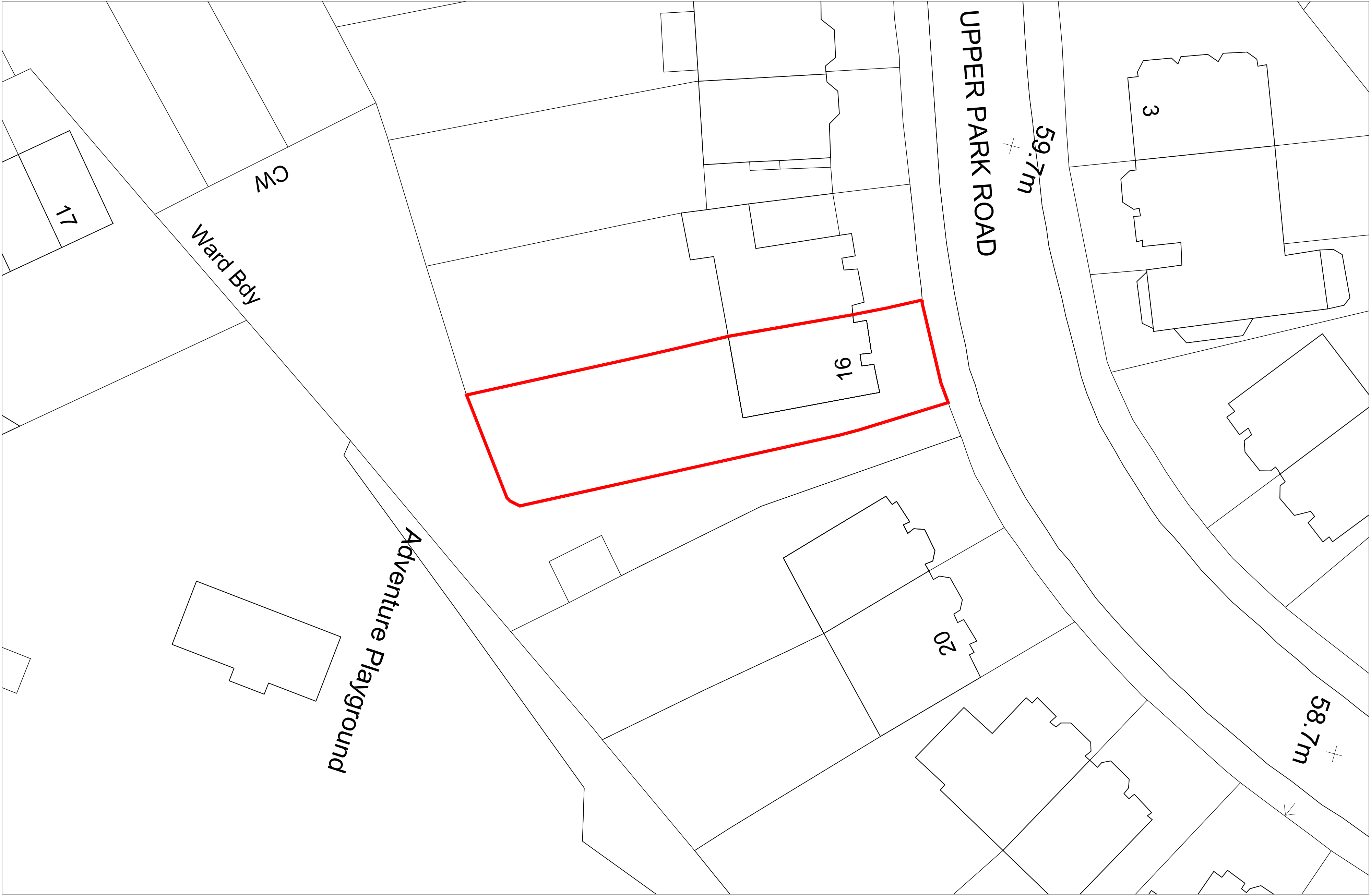
SITE PLAN SCALE 1:500@A3 LP-01