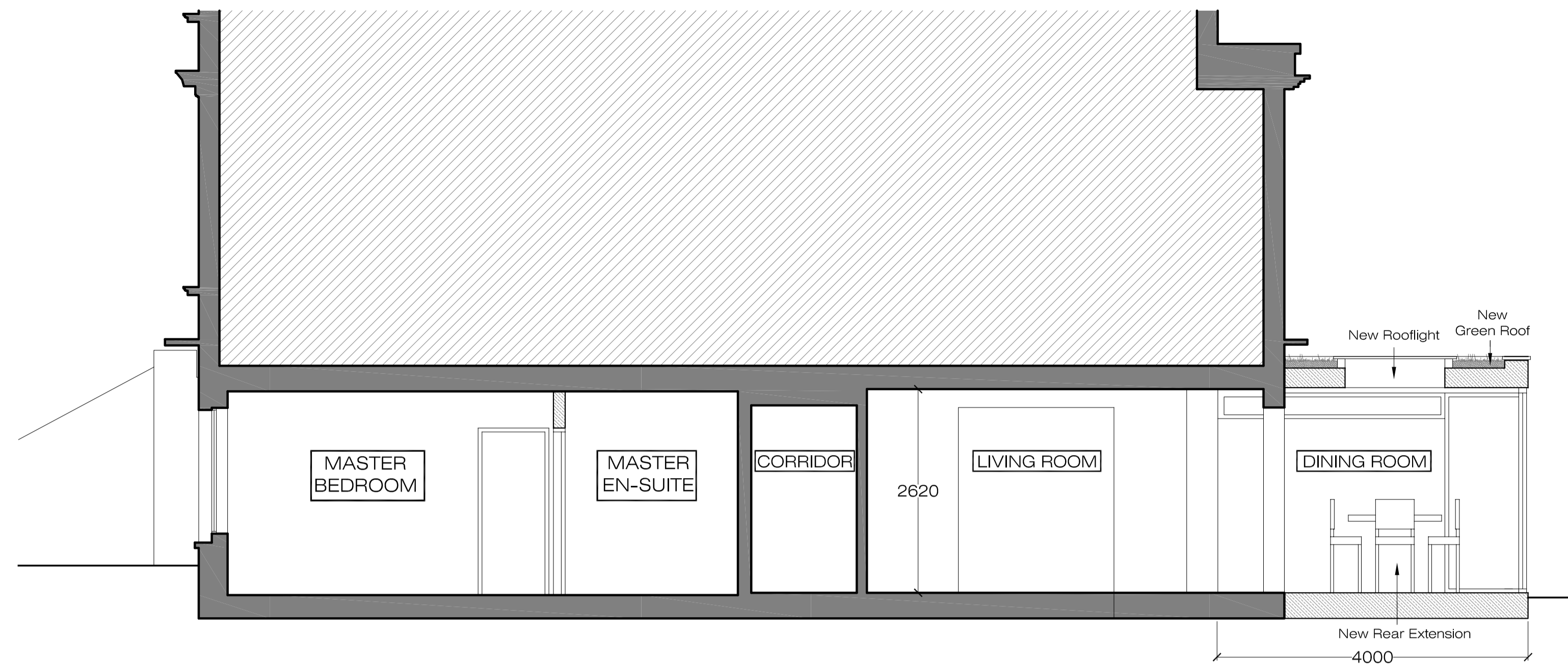
PROPOSED Section AA