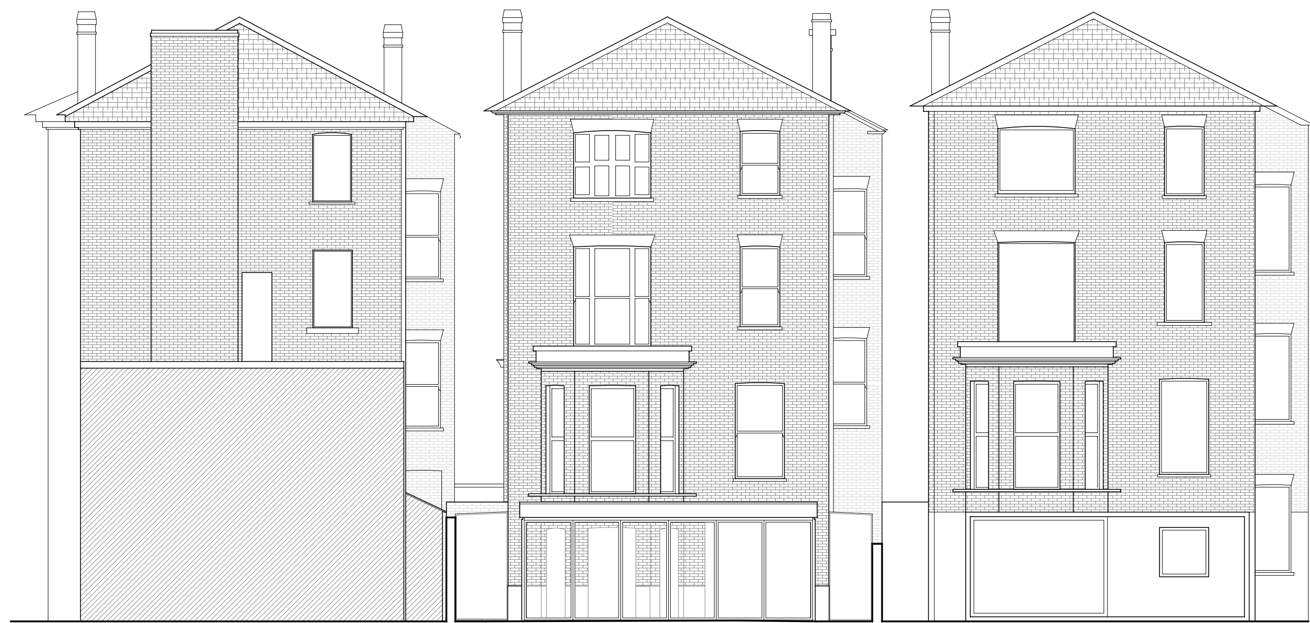
26 FELLOWS ROAD PROPOSED Rear Elevation Fellows Road SCALE 1:100@A1 PA-03