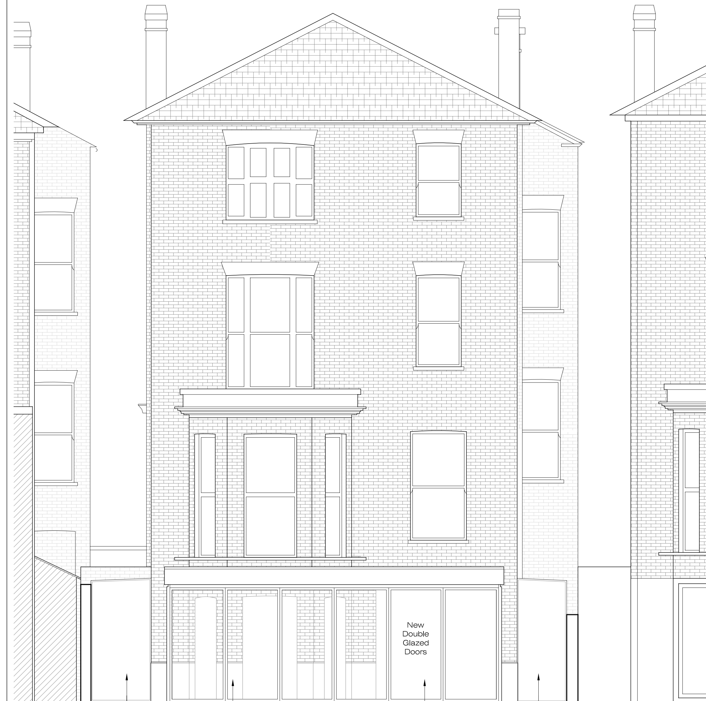
New Frameless lightweight glass Side Infill Existing bay window retained New Rear Extension New Frameless lightweight glass Side Infill