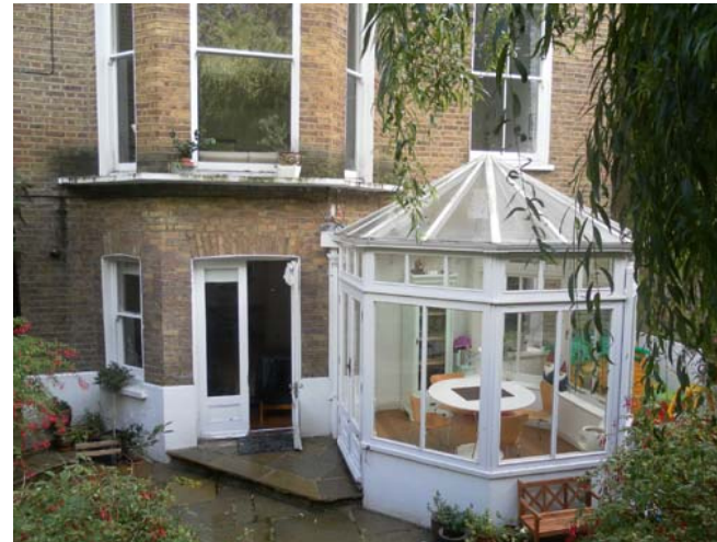
28 Fellows Road - Rear Elevation SCALE NTS@A1 EPH-01