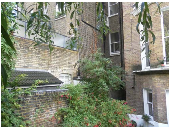
Party Wall between 26 & 28 Fellows Road SCALE NTS@A1 EPH-01