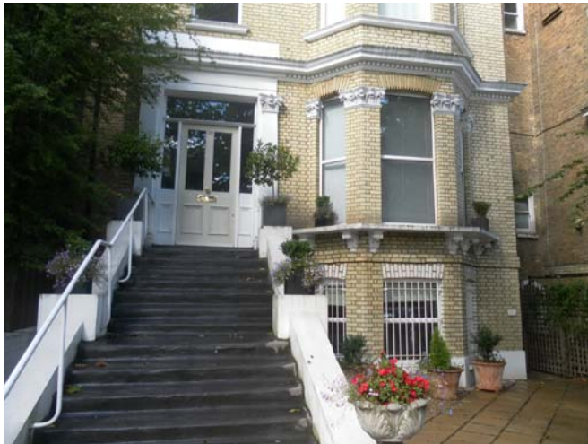
28 Fellows Road - Front Elevation SCALE NTS@A1 EPH-01