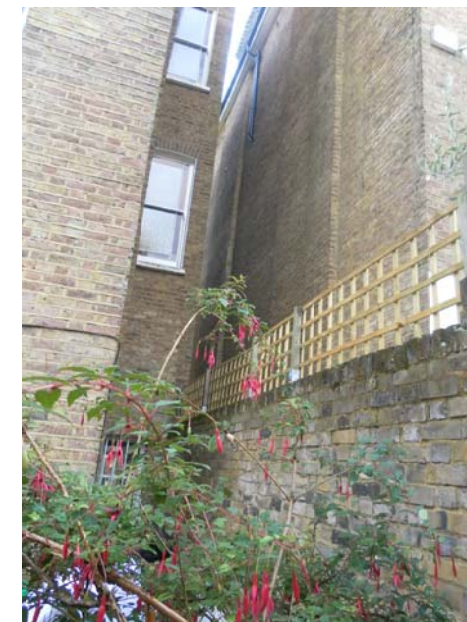
Party Wall between 28 & 30 Fellows Road SCALE NTS@A1 EPH-01