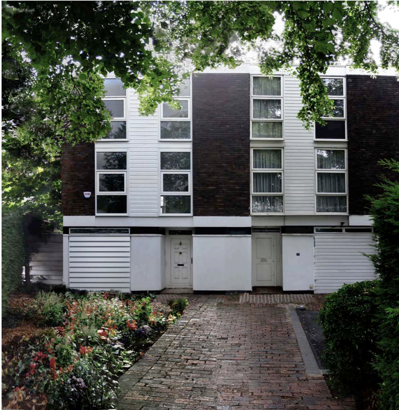
V3 PROPOSED FRONT ELEVATION