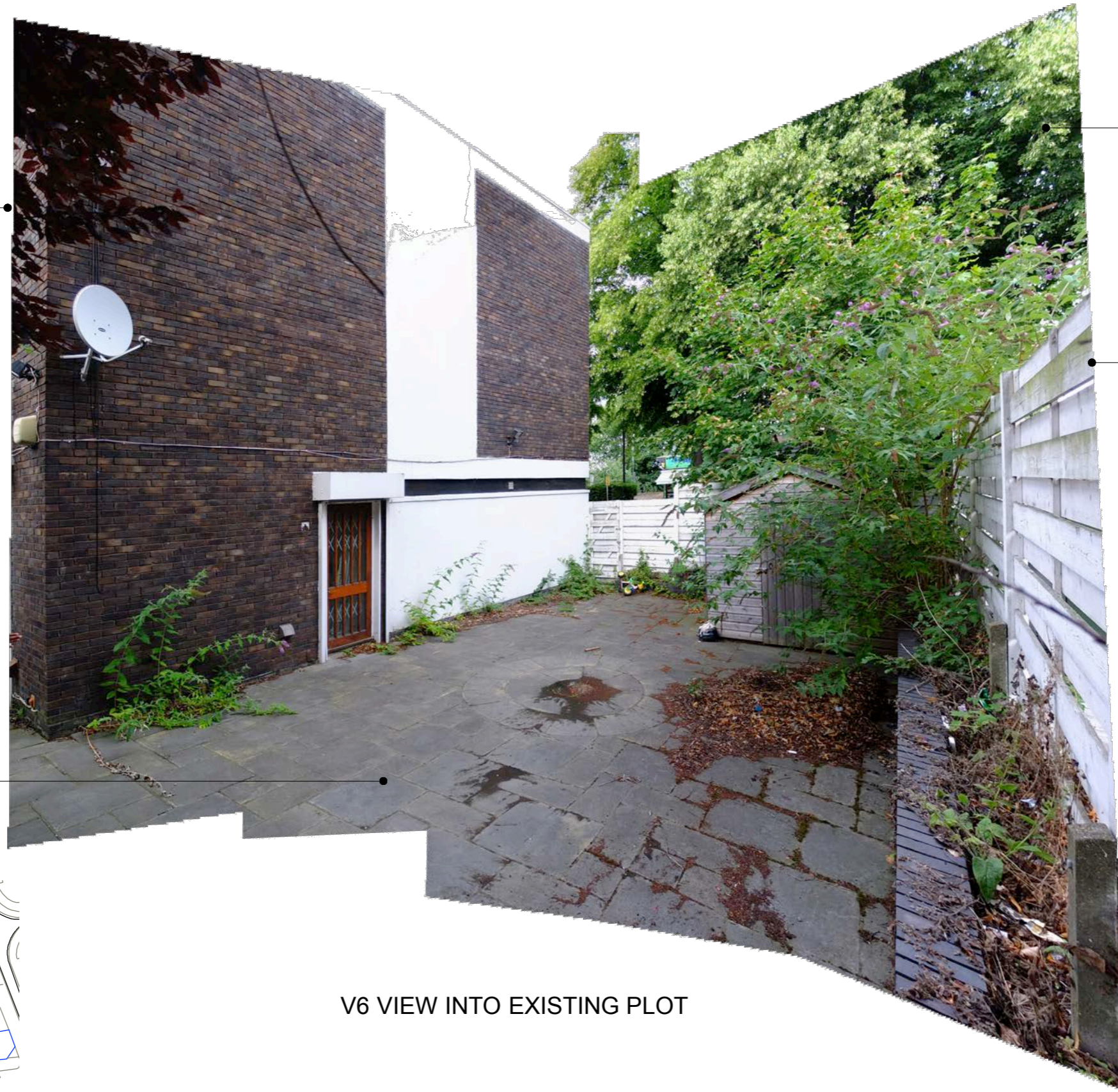
V6 VIEW INTO EXISTING PLOT