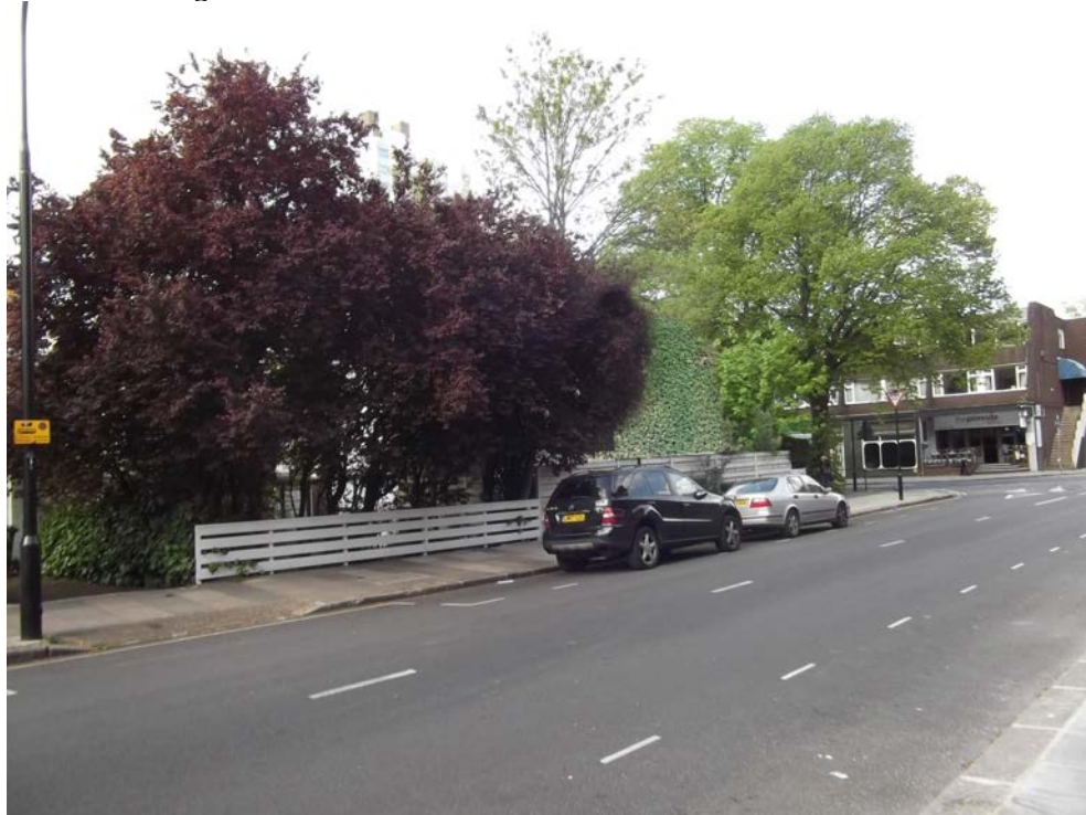
Above: Proposed View 1