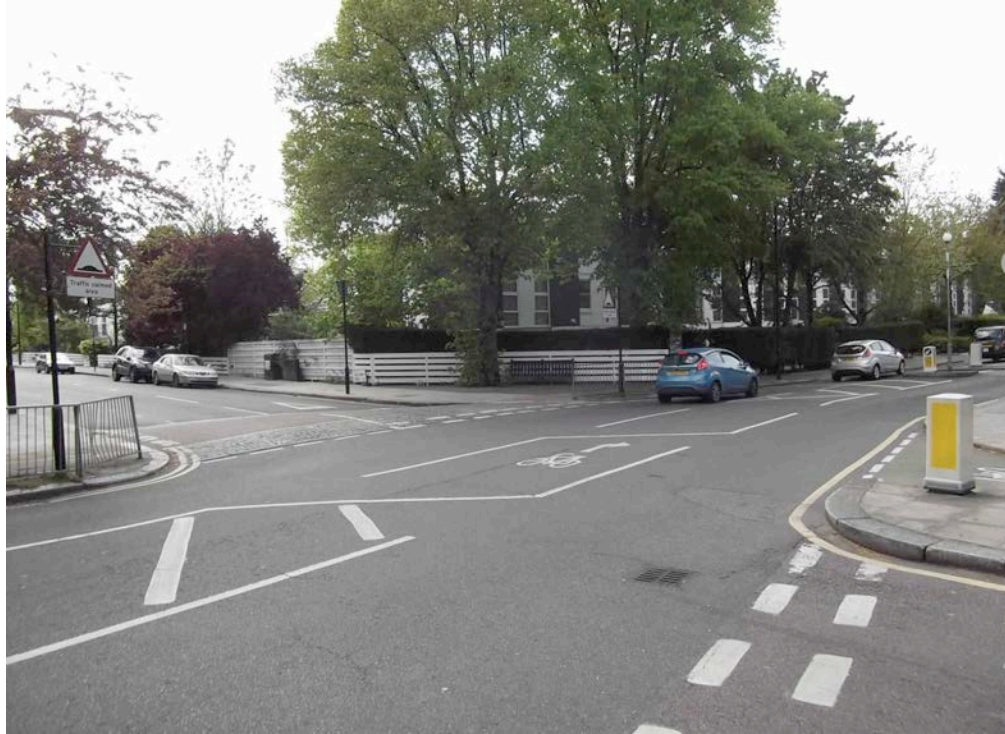
Above: Existing View 7