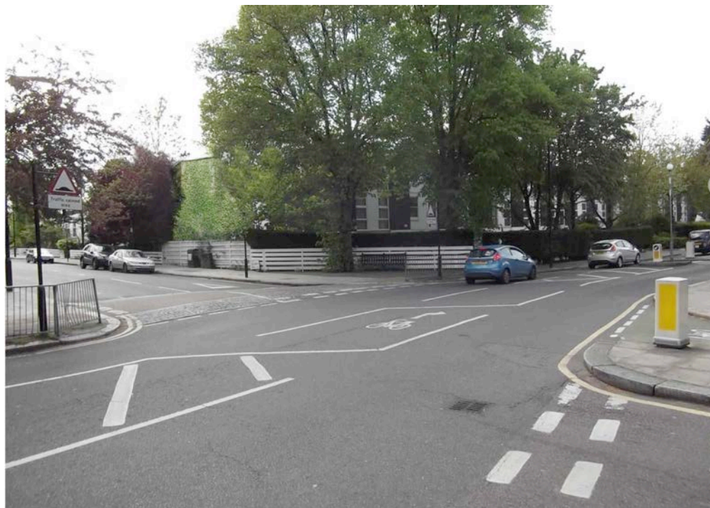
Above: Proposed View 7