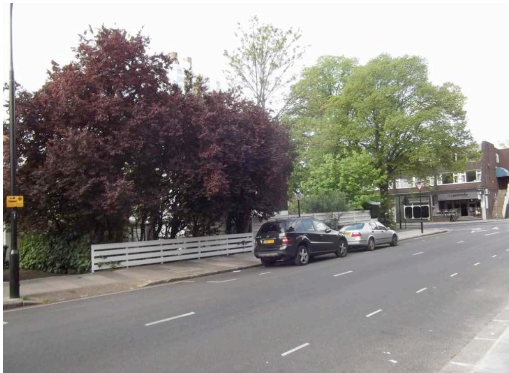
Above: Existing View 1

Key Plan – Seen from the Church, the extended terrace would have a visible relationship with to the three-storey brick retail and residential buildings opposite.