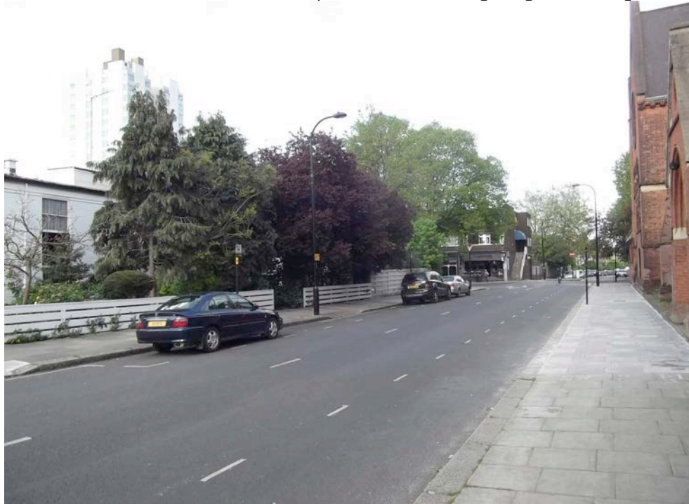
Above: Existing View 2