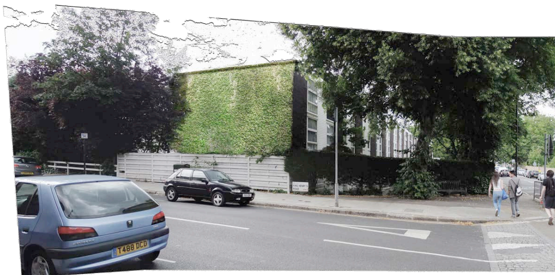
Above: With Green Wall

To further counteract the increased presence of the minimal end-wall of the new dwelling, an irrigated living green-wall is proposed that will be visible from the public footpaths that run either side of King Henry's Road. The following visualization has been prepared to illustrate how the proposed green wall will look from eastern end side of King Henry's Road. As is apparent from the image this strategy will blend the building into the two adjacent trees softening its presence at the roadside.