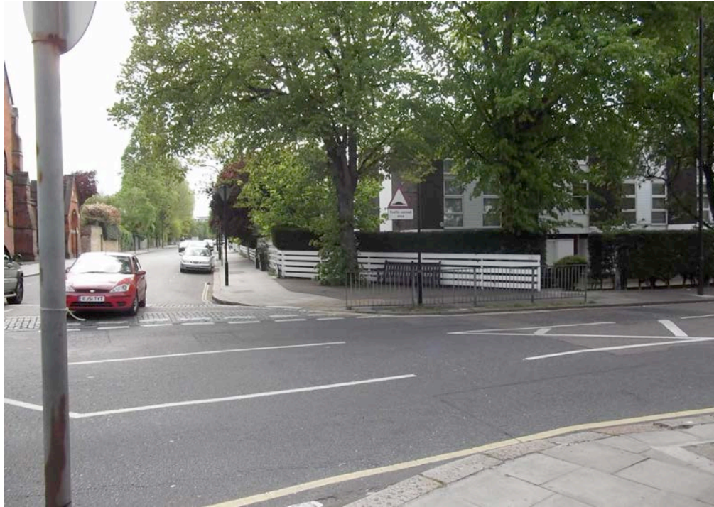
Above: Existing View 6