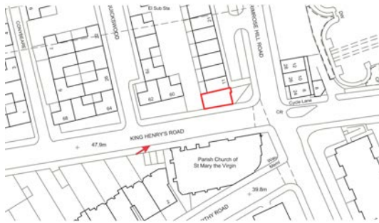
Key Plan View 2 – Large trees on both sides of the property effectively mask the new dwelling after about 50m, and serve to break up the sense of a single legible building line.