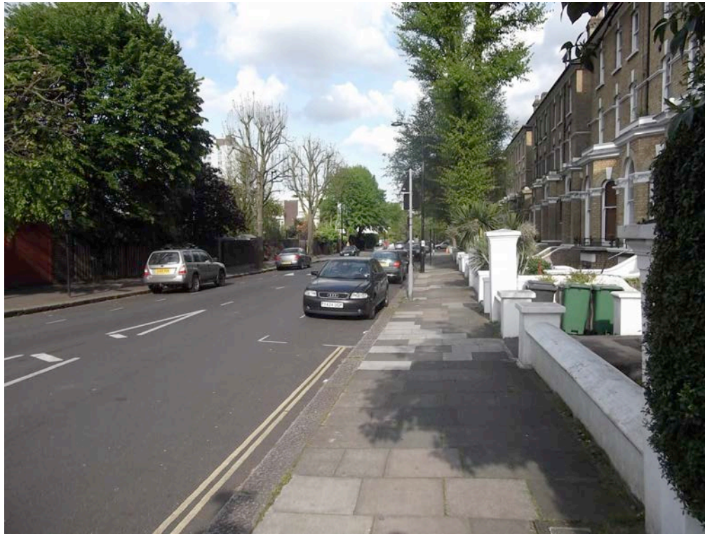
Above: Existing View 3