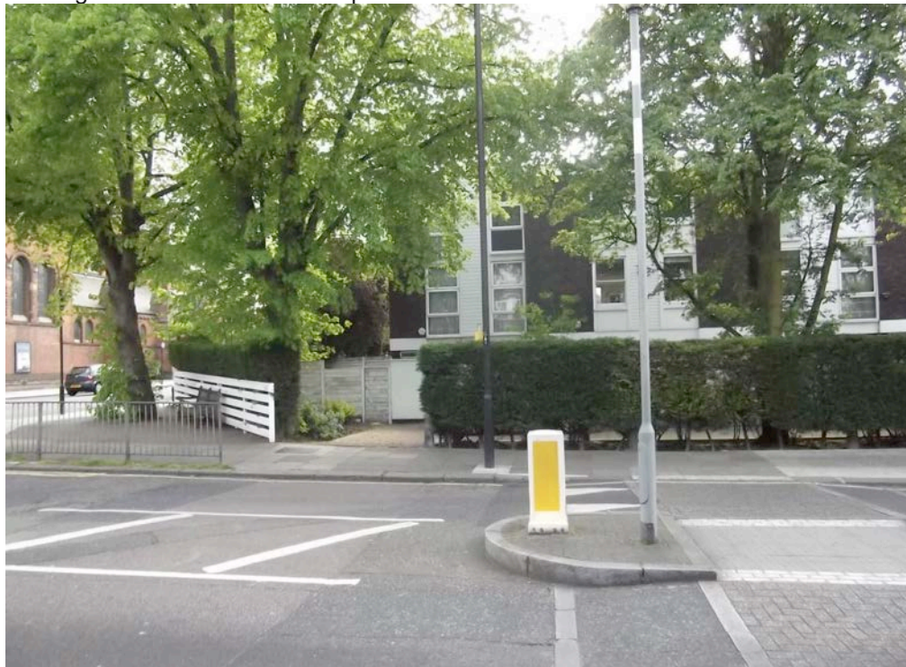
Above: Existing View 5