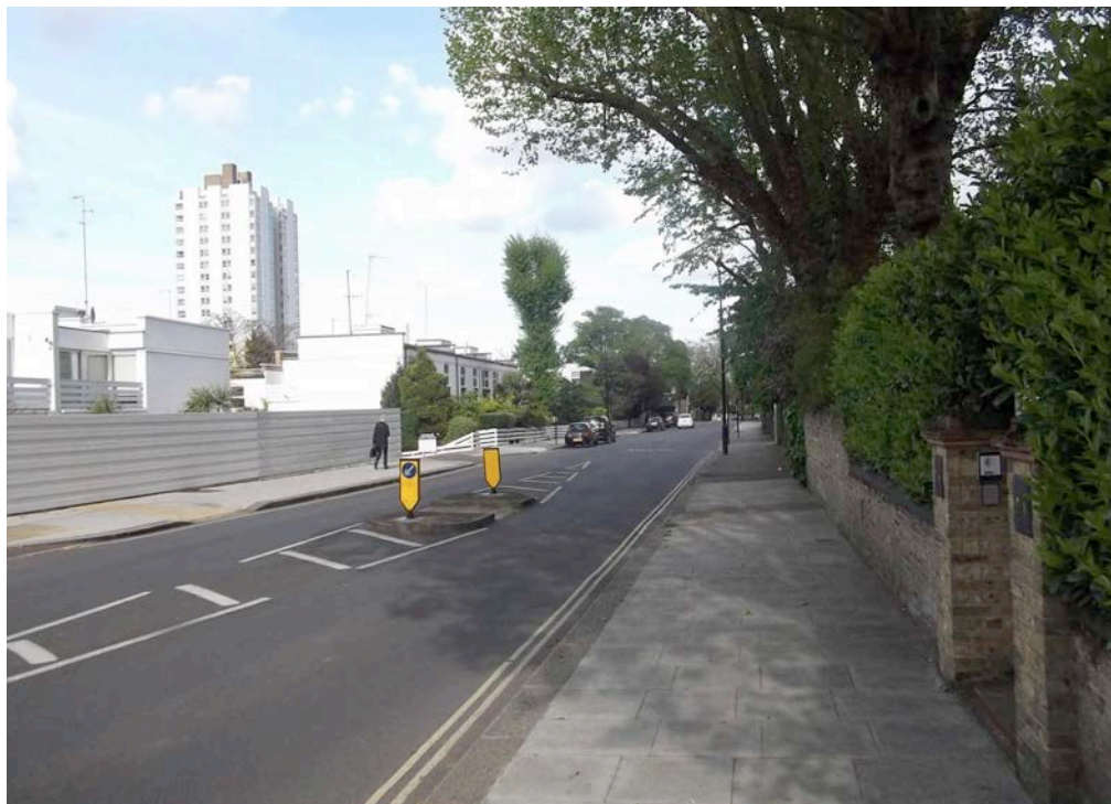
Above: Proposed View 4