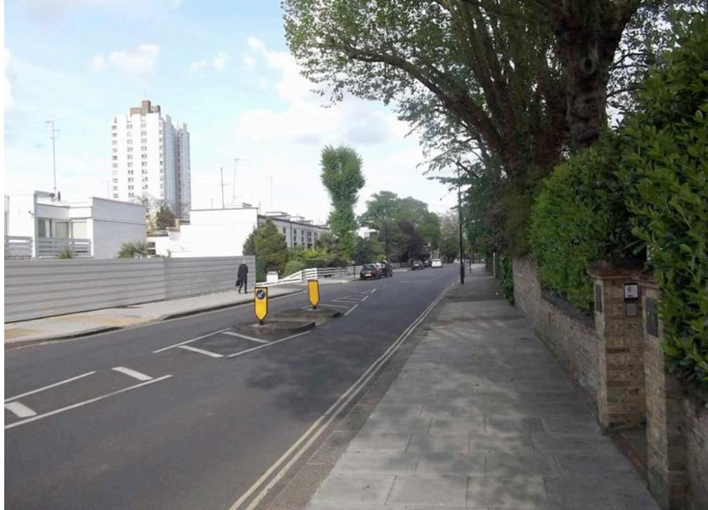
Above: Existing View 4