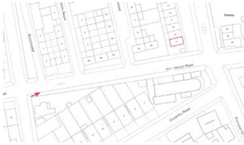
Key Plan View 3 – Unlike the opposite side of the road,