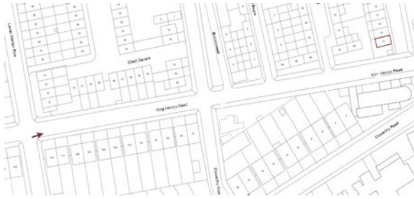
Key Plan View 4