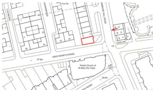
Key Plan View 5 – The large trees, which will be retained with root protection, screen the new building and reduce its visible impact.