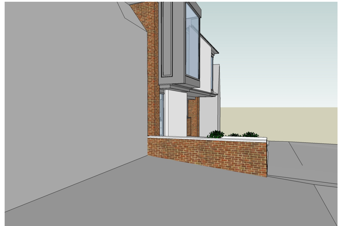
View of wall from road towards neighbouring side of 2B Briardale Gardens