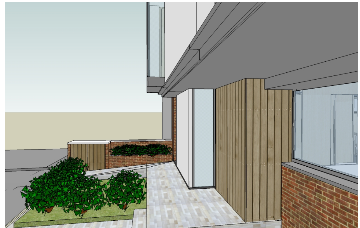
View of wall from road towards the side of the new house