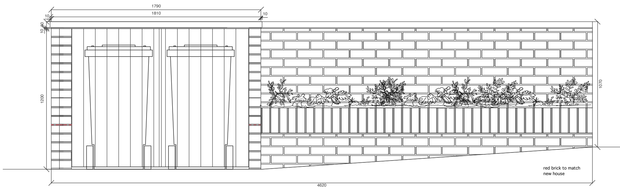
Elevation from new house