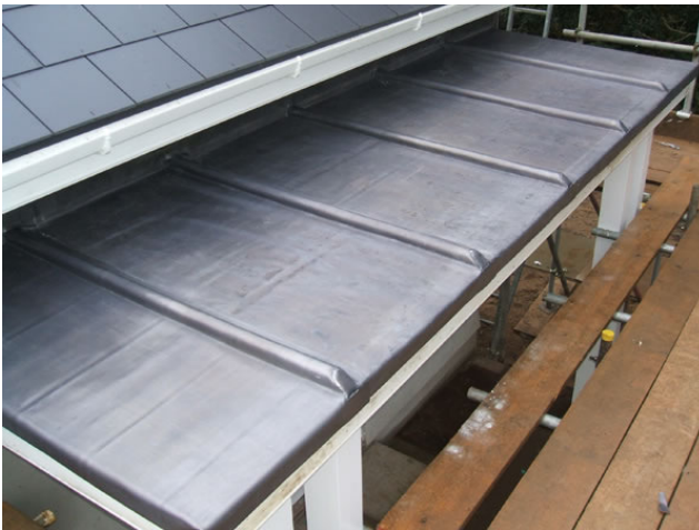
Lead flat roof covering with traditional roll joints