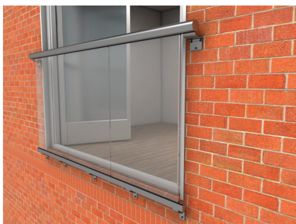
Glass Juliette balcony with stainless steel handrail (to rear elevation).