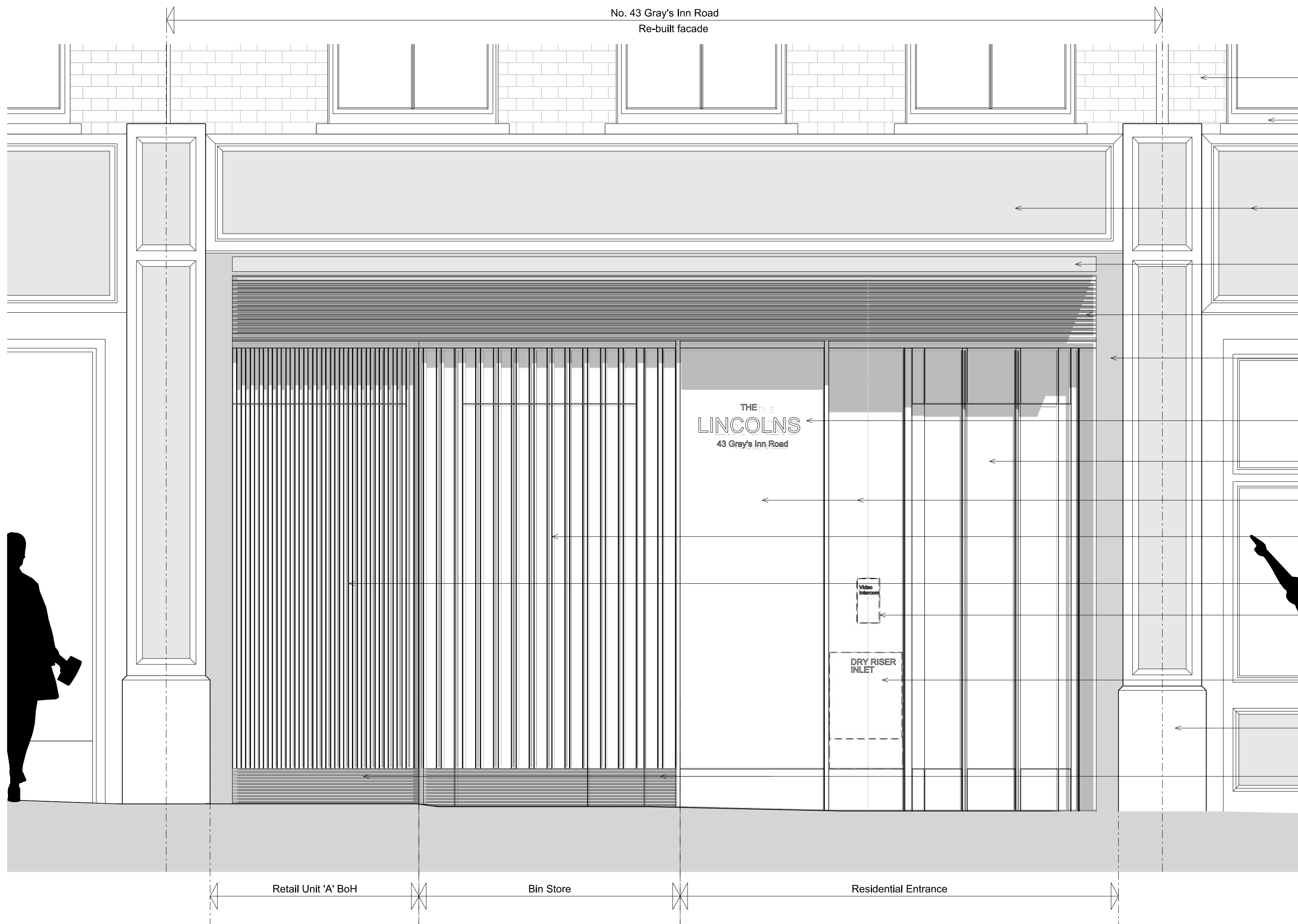
02 Elevation: Residential Entrance 1:20