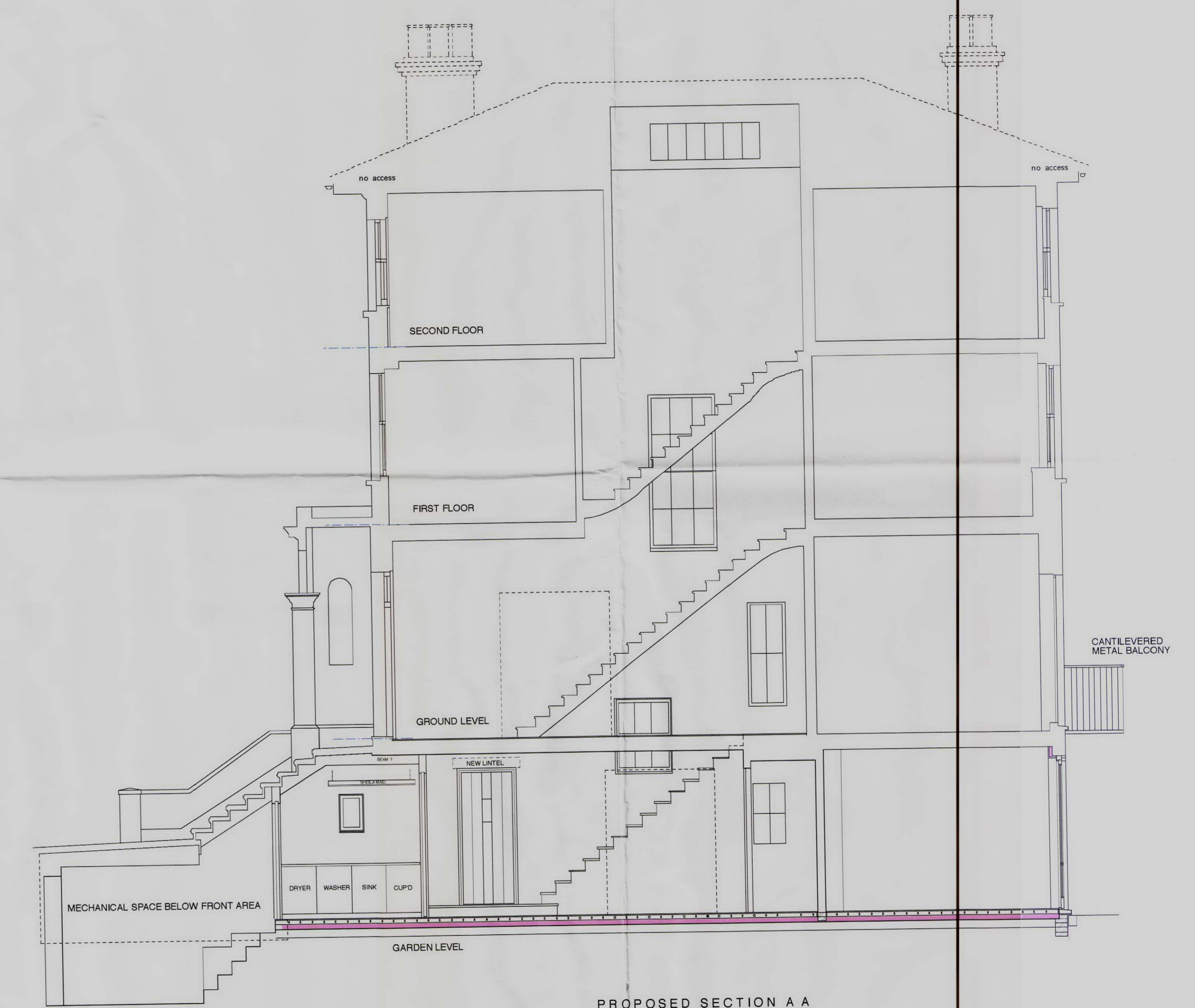
PROPOSED SECTION A A