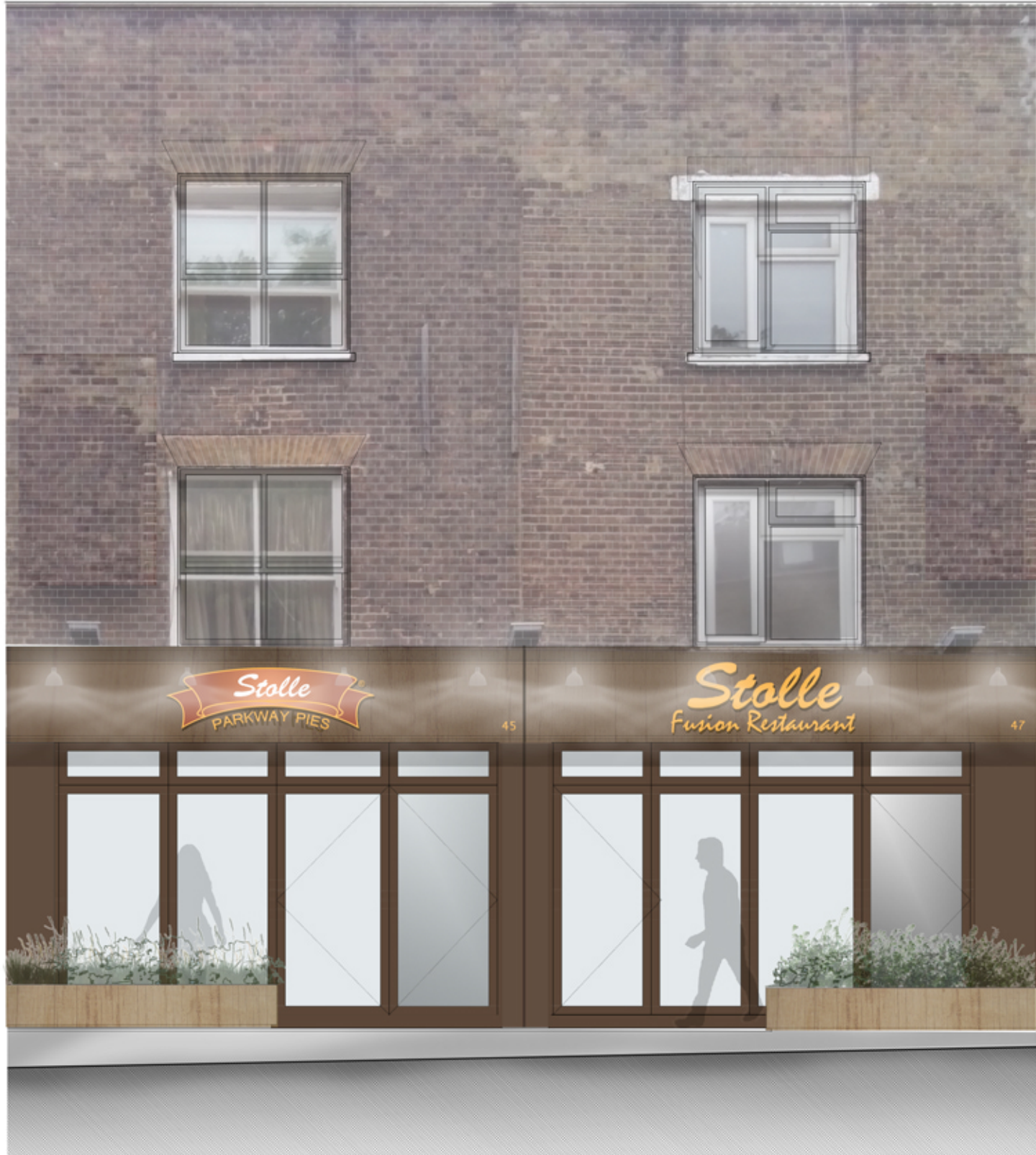
PROPOSED STREET ELEVATION _ Scale 1/50