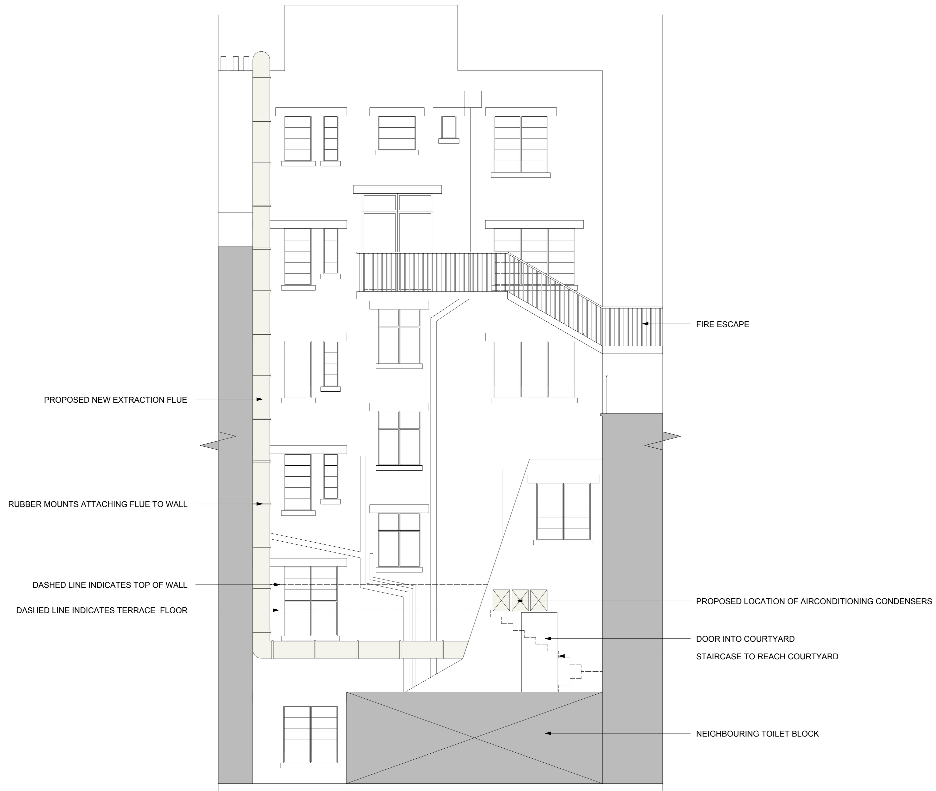
EAST ELEVATION scale: 1:50@A1