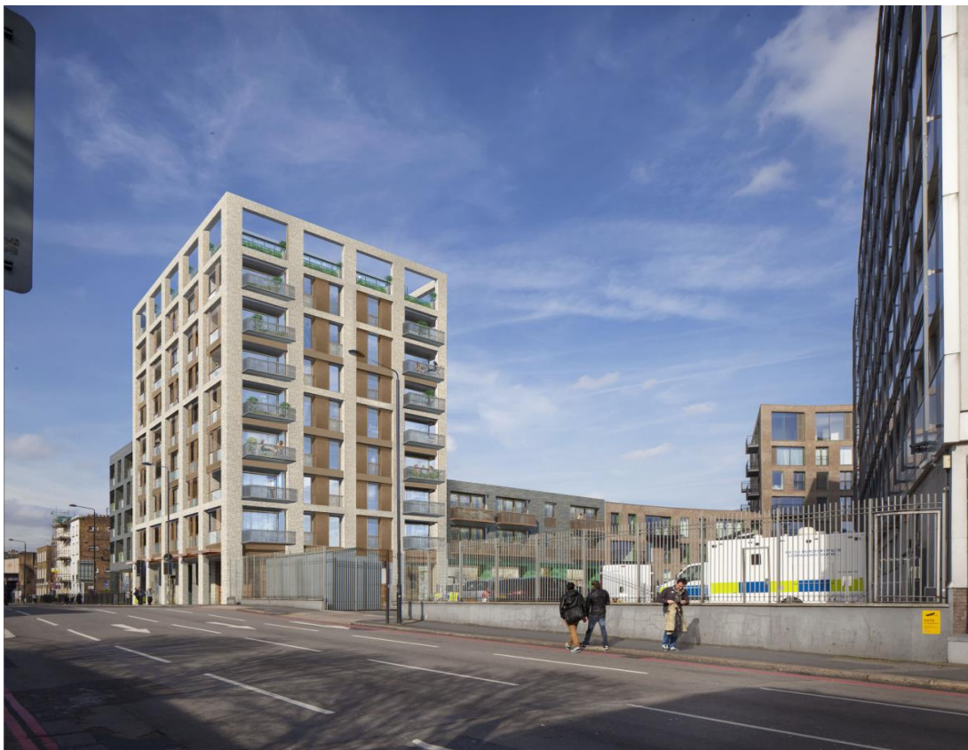
Fig 1 - Proposed Camden Street development

There is a requirement within the Borough for the residential flats to achieve Code Level 4, as well as 50% of the credits within the Energy, Water and Materials sections.