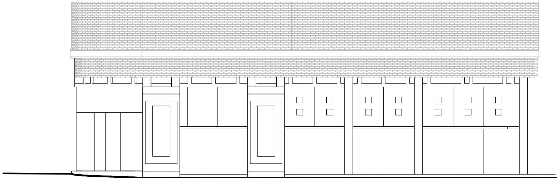
West Elevation 1:100