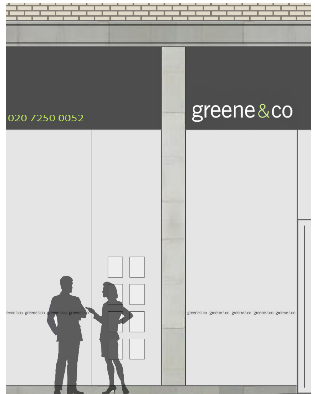
Proposed Elevation of Facade 1:25