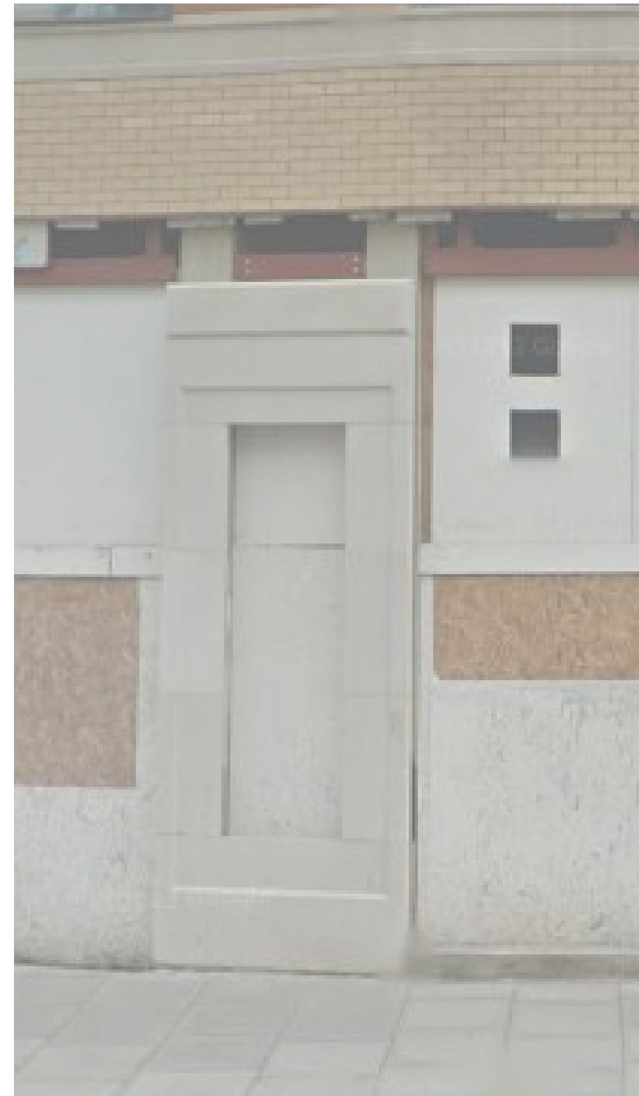
Photo of Existing Elevation of Facade