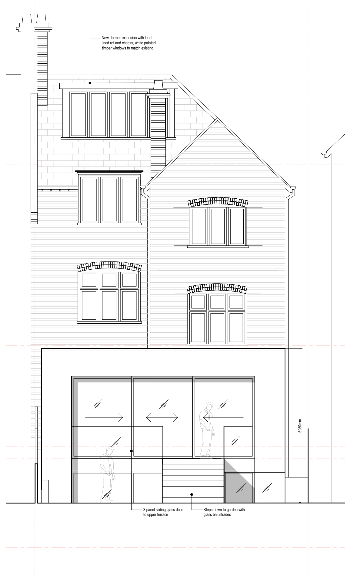
ELEVATION TO GARDEN