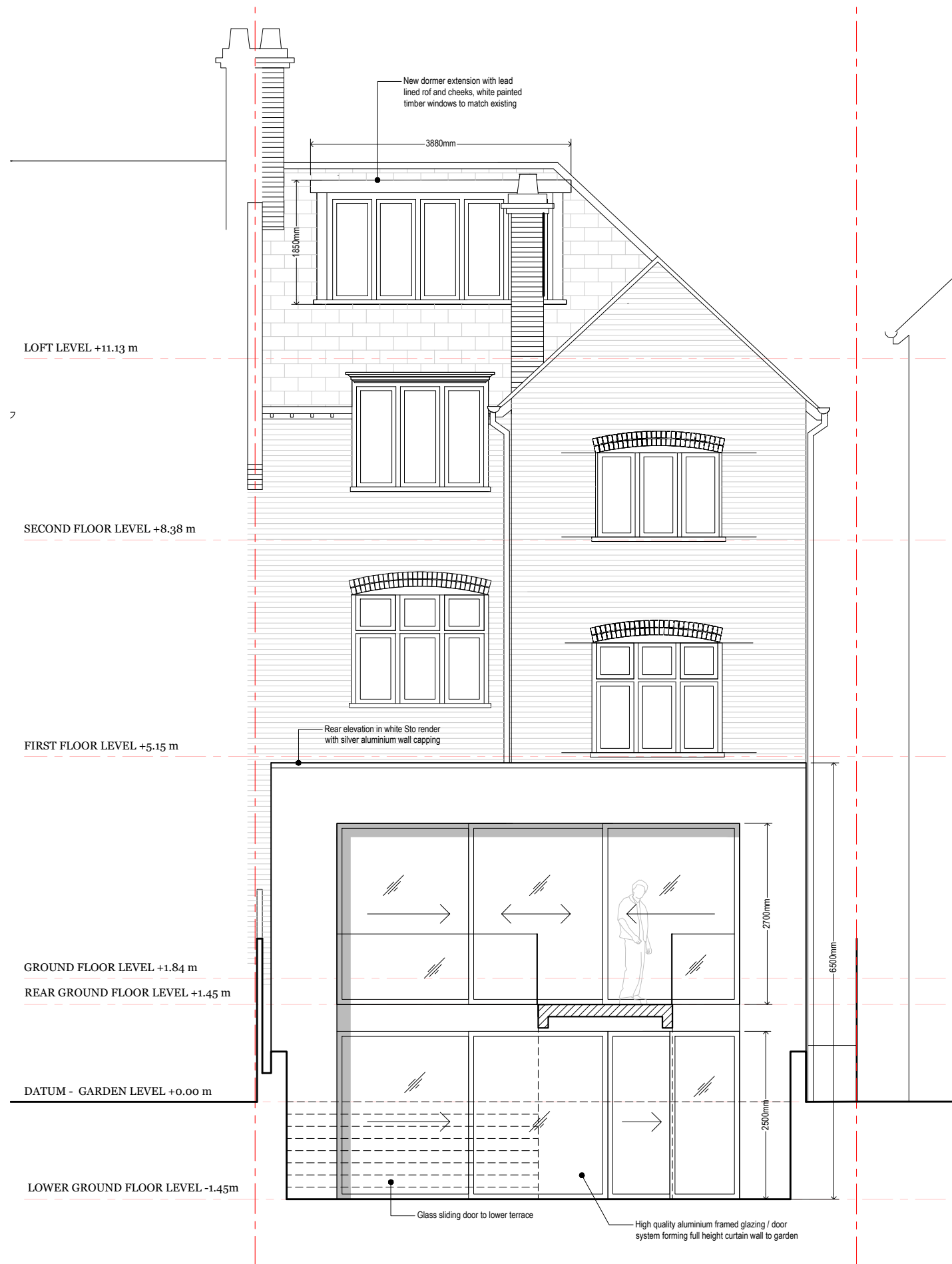
ELEVATION TO LOWER TERRACE