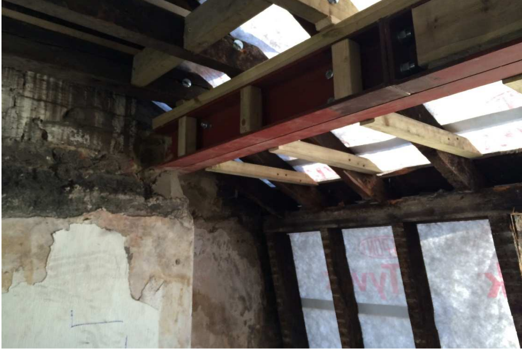
Photo 12 Third Floor, Rear Room T03 Showing new steels to take up sag in roof. Ex celing joists and roof rafters retained