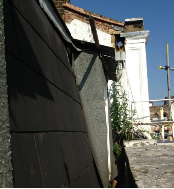
Photo 01 Existing Roof Eternit Slates and Felt To Dormers