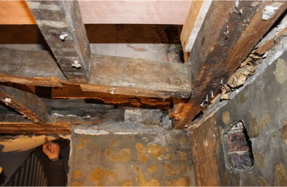
Photo 06 Landing G04 Rotten floor joists. (Woodworm) To be replaced