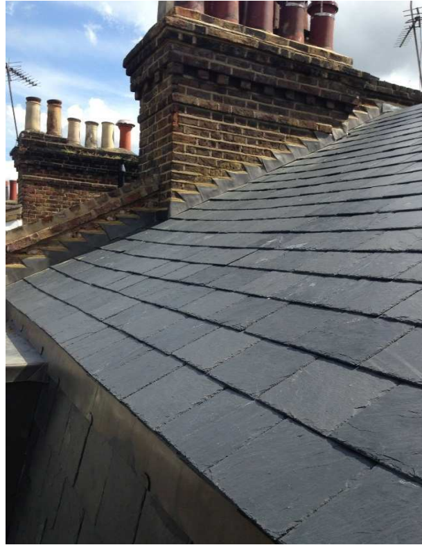
Photo 02 & 03 Proposed roof, natural slates with Lead Dormers