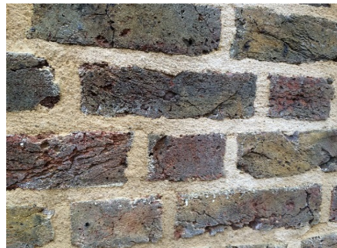
Photos 09 and 10 New Lime Mortar pointing Bricks replaced with second hand bricks to match Downpipes replaced with cast Iron