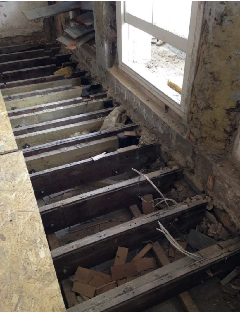
Photo 05 First Floor Drawing Room, F02 Showing existing Concrete beam under windows Concrete infill in between windows Joists extended and bolted to existing