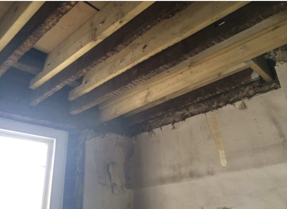
Photo 07 Master Bedroom S01 Photo showing new floor joists bolted to Original