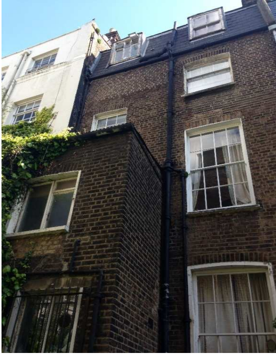
Photo 08 Existing Rear Elevation Some non Original Windows, poor brickwork and Pointing