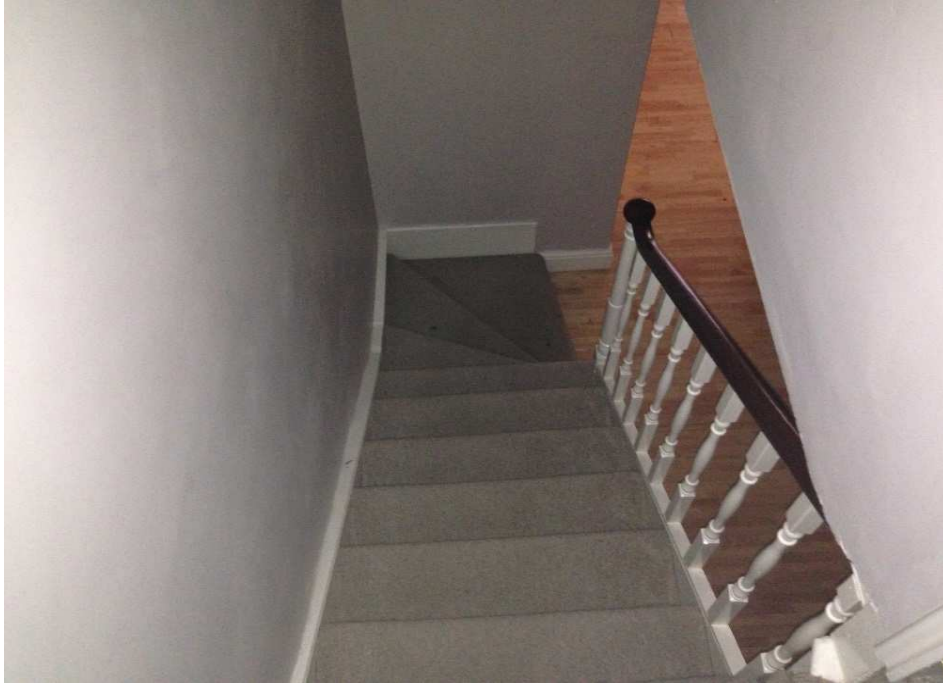
Photo 04 Stairs to Lower Ground Floor

Woodworm at upper level and damp rot at lower level Replace with new, pine staircase to match, Retain handrail. New square spindles