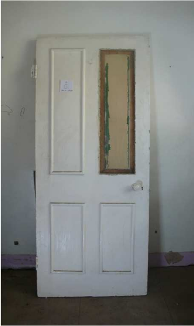
Photo 43 Location: Third floor TD - 03 Comments: Re Use on third floor in TD 06