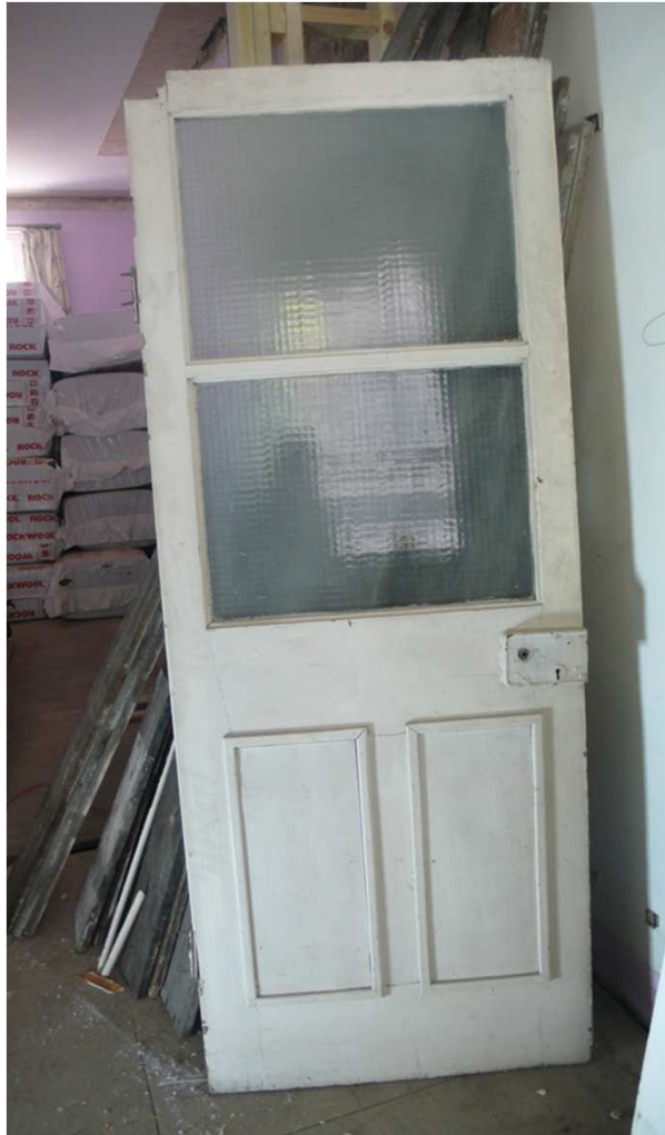
Photo 36 Location: Lower Ground Floor LGD - 08 Comments: Discarded