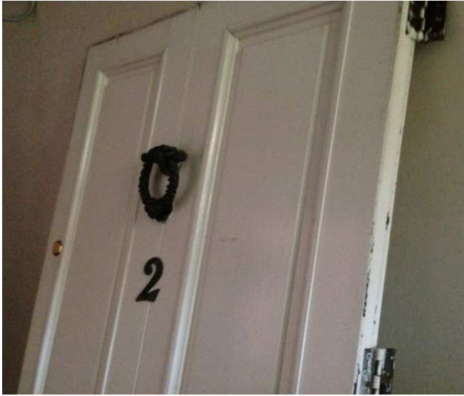
Photo 37 Front door GD - 05 Comments: New door to match others in street As below