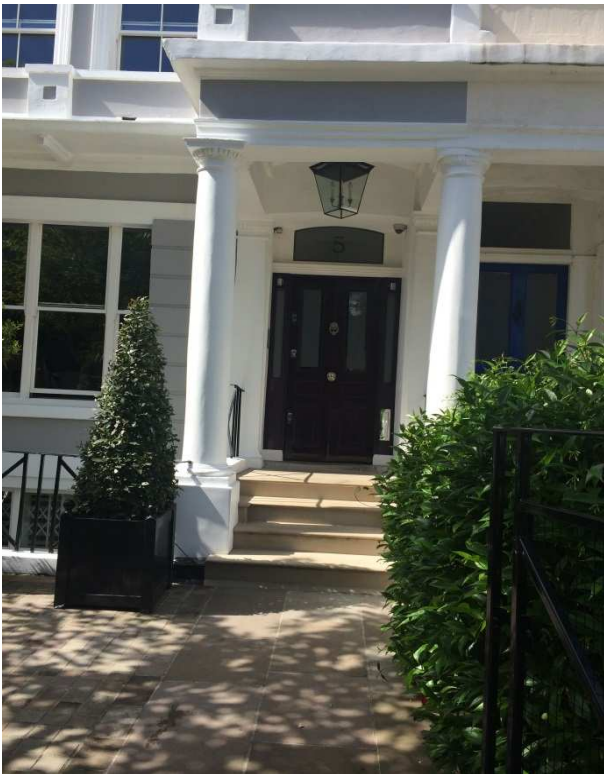
Photo 38 Door number 5 Chalcot Sq