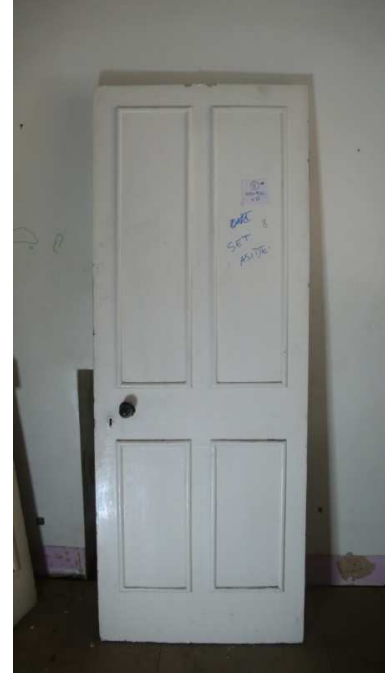
Photo 45 Location: Second floor SD - 04 Comments: Re Use on Third floor in TD 08

Note :Infill panels and half-round beading were added to the doors in the mid 20th century, and that we propose to remove these infill panels and trims, to expose the original recesses panels and profiled mouldings