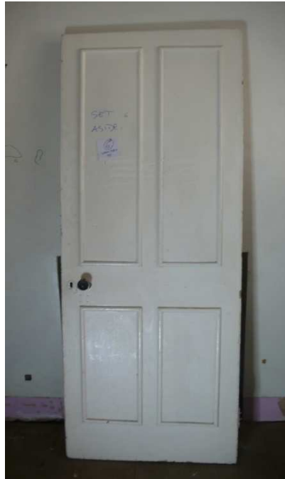
Photo 44 Location: Second floor SD - 01 Comments: Re Use on Third floor in TD 07