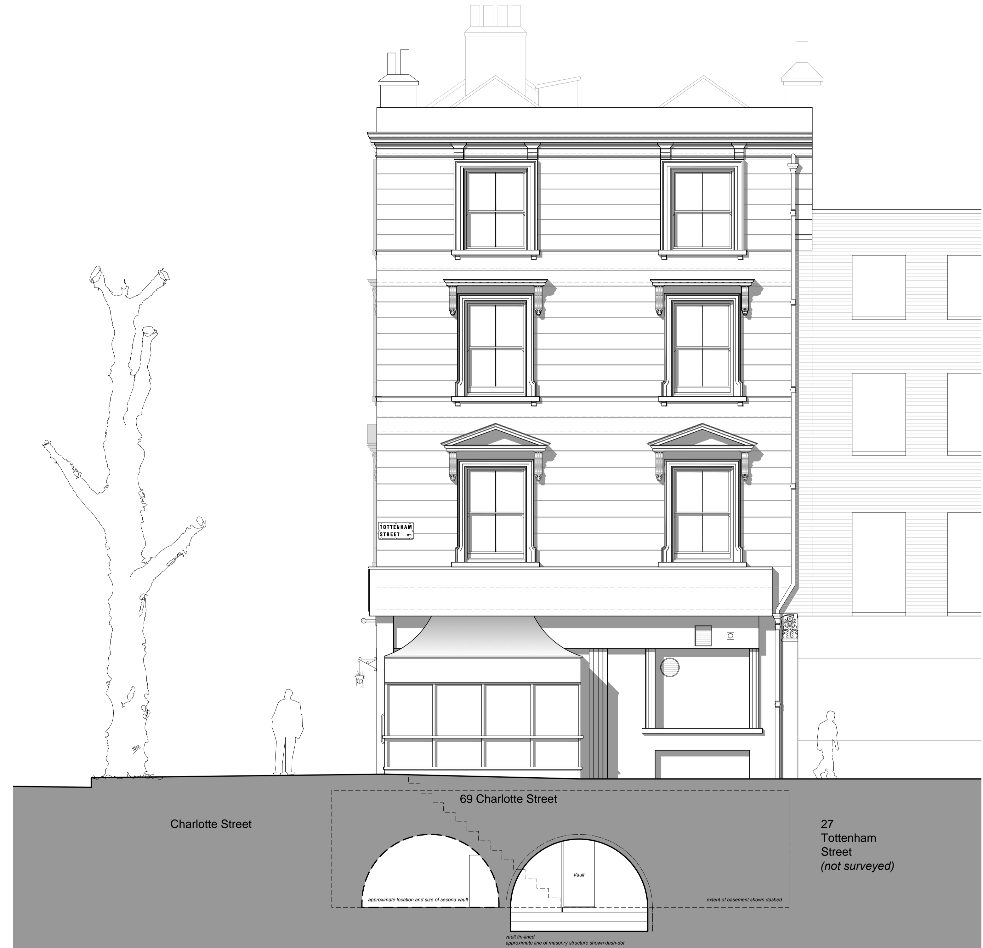
Tottenham Street Elevation (north)