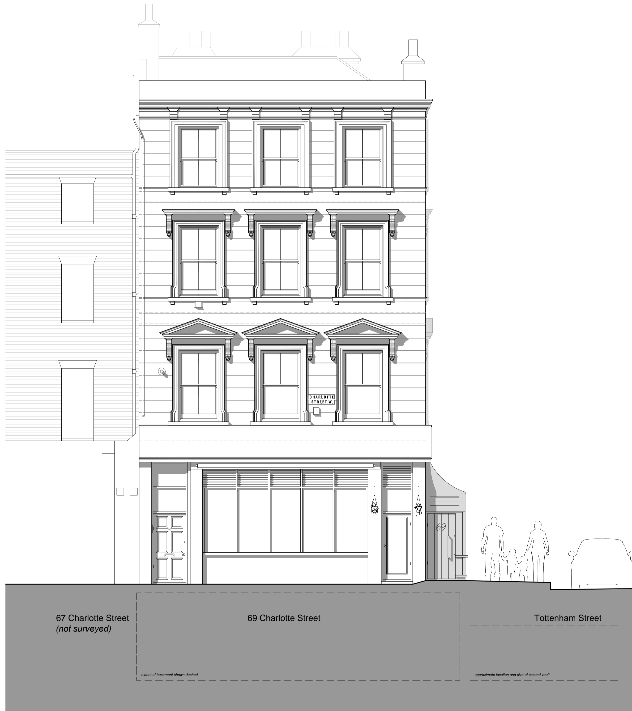
Charlotte Street Elevation (east)