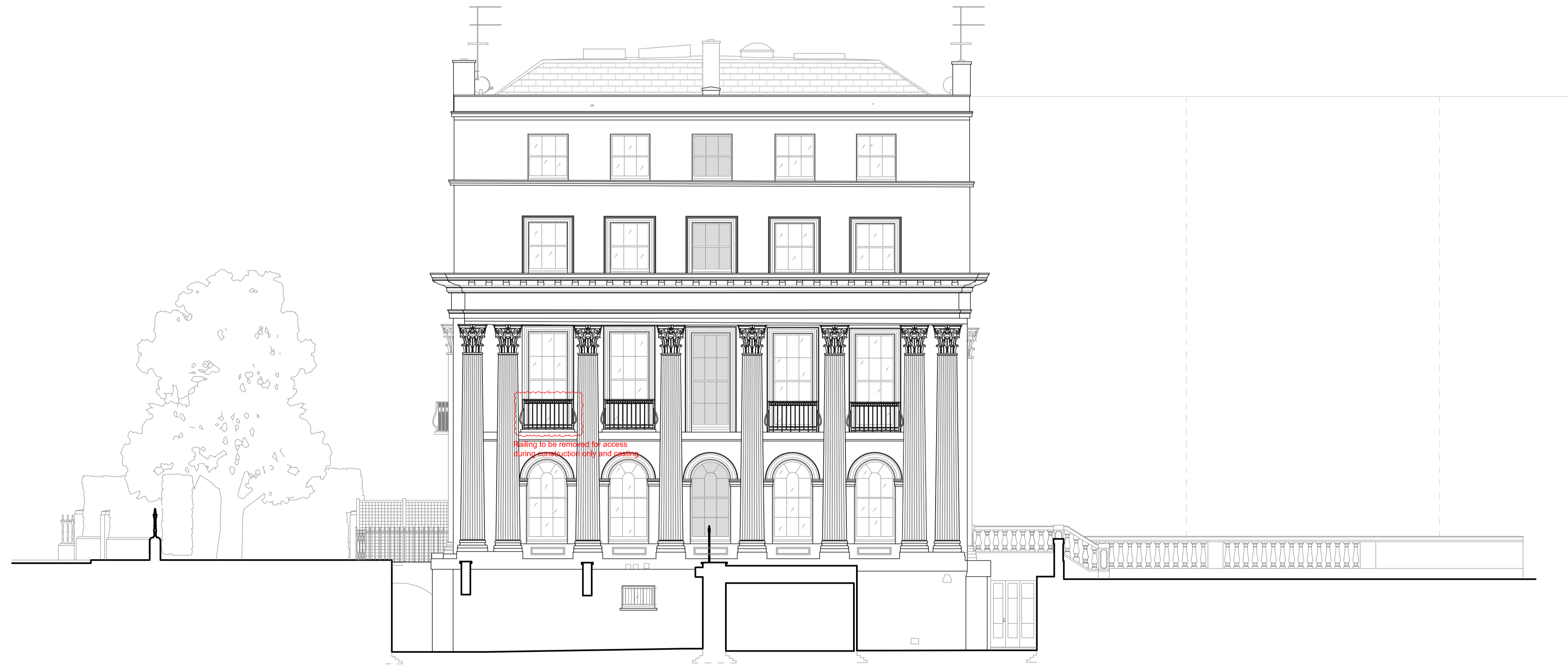
02 Existing Elevation - West Scale 1:100