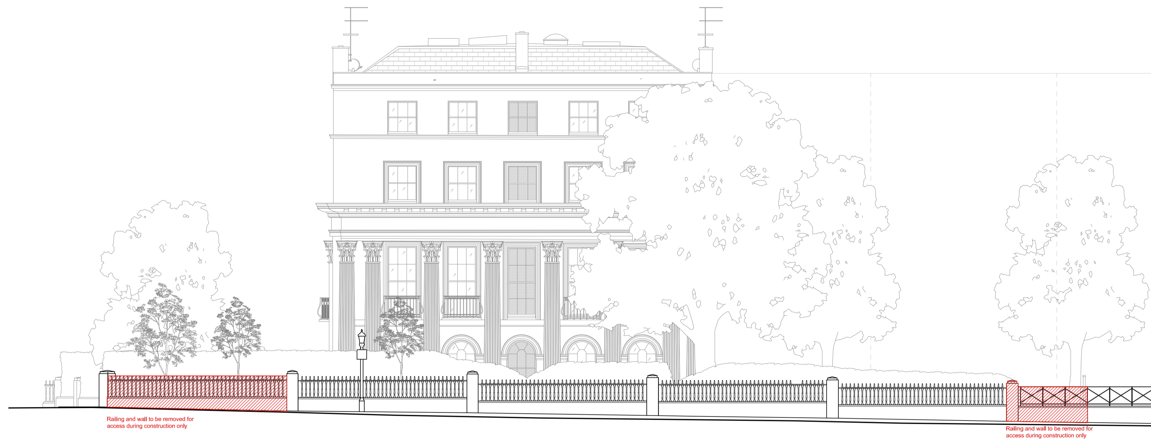
01 Existing Street Elevation - West Scale 1:100

General Notes: 1. No dimensions are to be scaled from this drawing. 2. All errors, omissions or inconsistencies are to be reported to Architect immediately. 3. All dimensions are to be checked on site prior to fabrication & construction. 4. Drawings show design intent only, detail & fabrication design by specialist sub-contractor. Refer to design portion & specification.