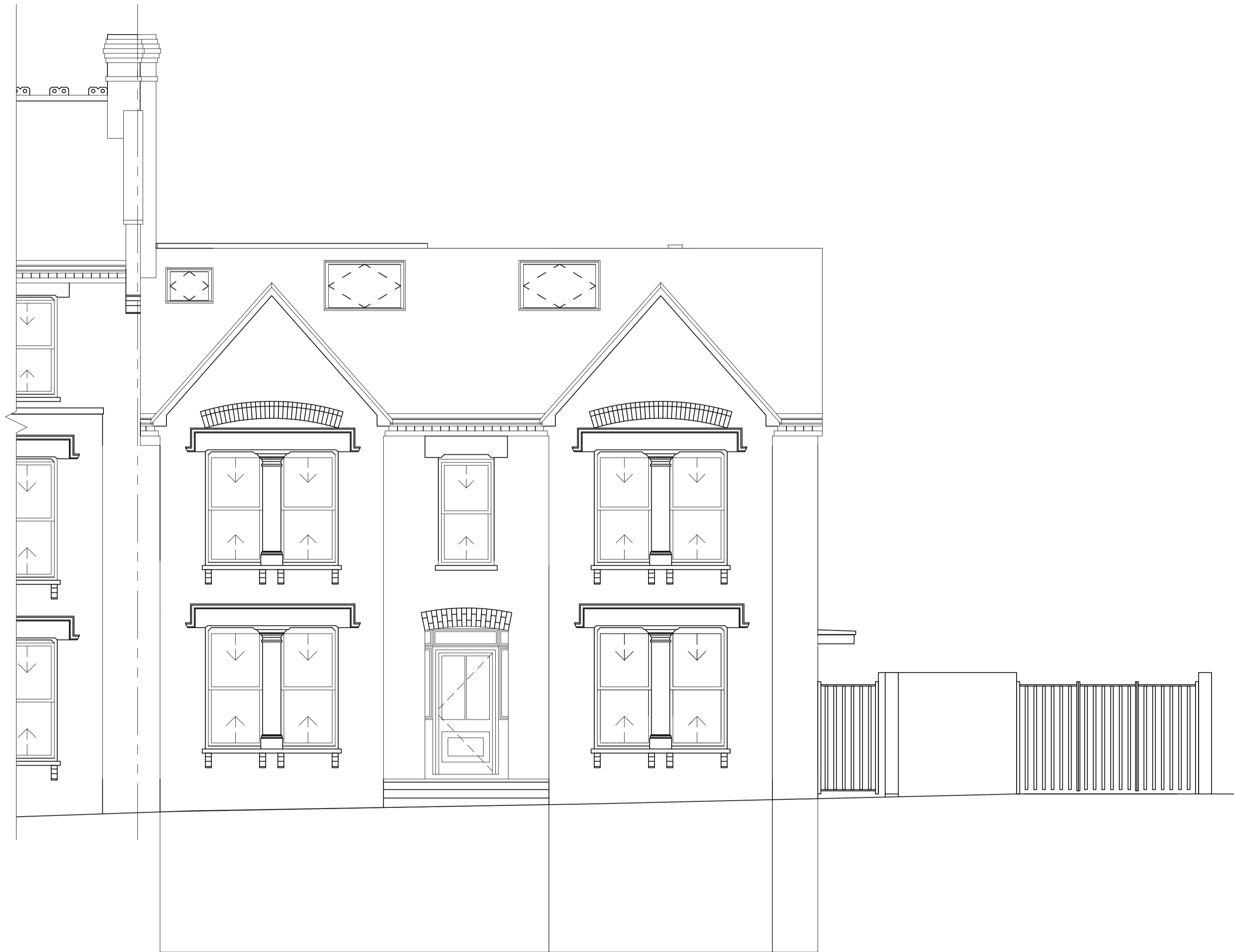
Proposed East (Front) Elevation showing basement window 1:50

Registered Office: The White House, Hockliffe Street, Leighton Buzzard, Beds. LU7 1HD. Registered in England No. 4970106