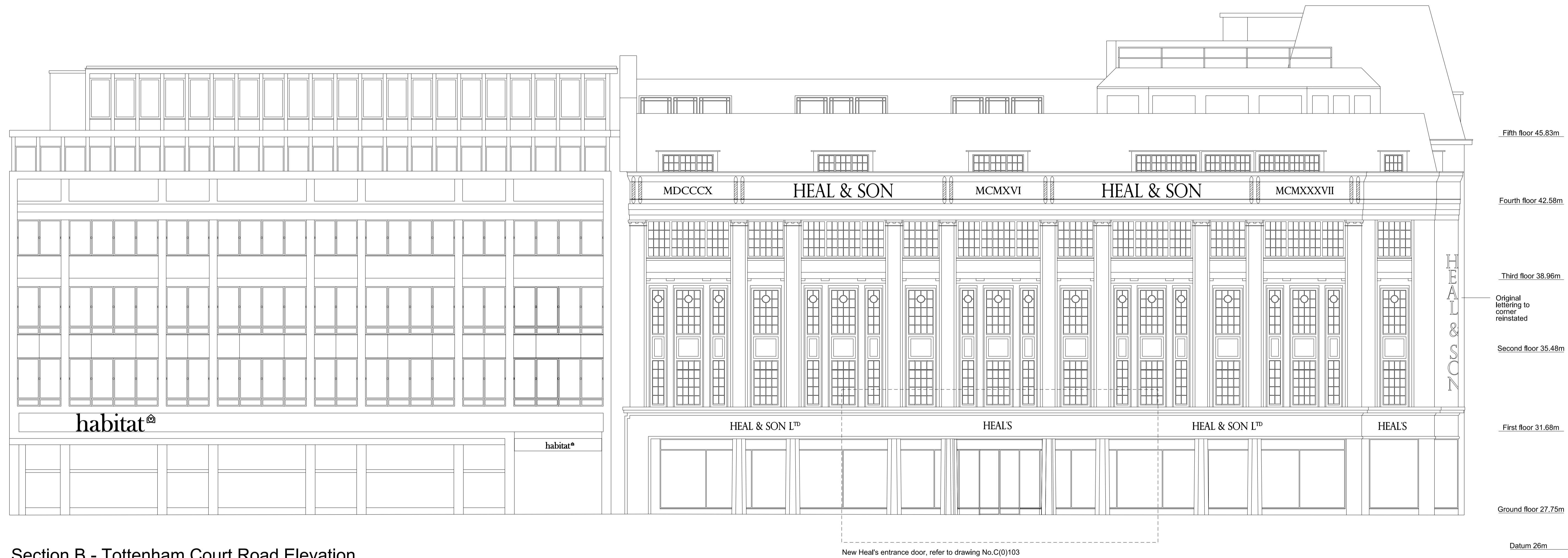
Section B - Tottenham Court Road Elevation

New Heal's entrance door, refer to drawing No.C(0)103