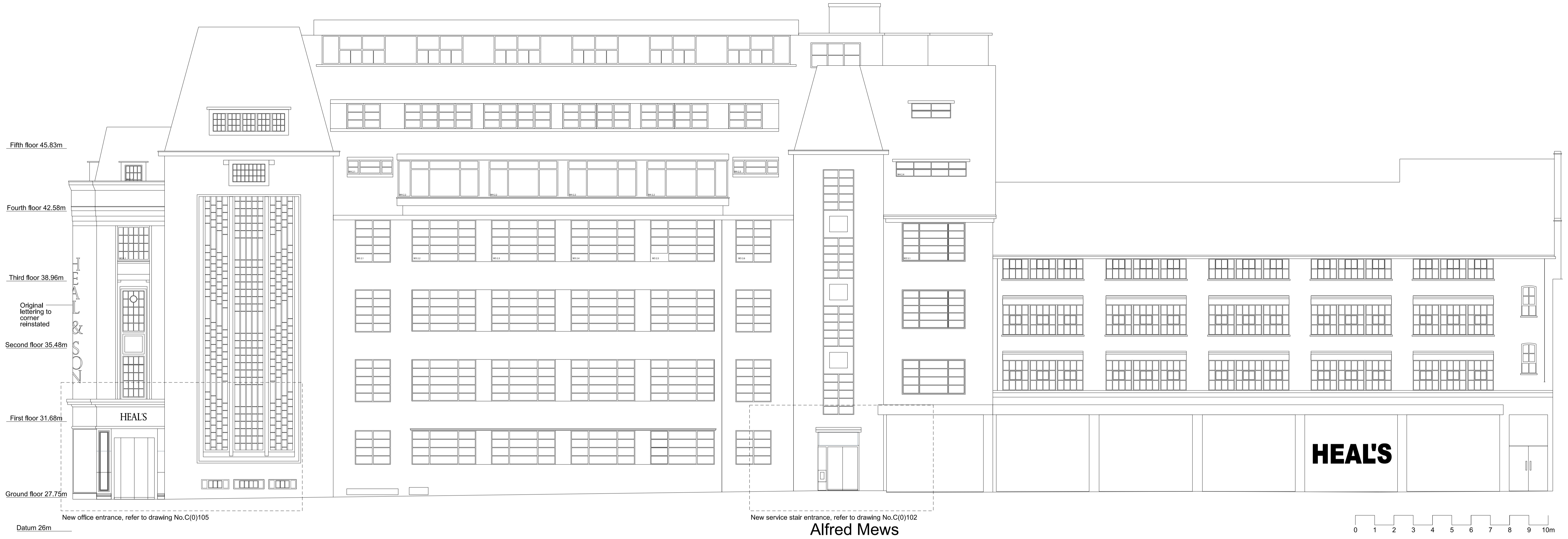
Section A - Alfred Mews Elevation