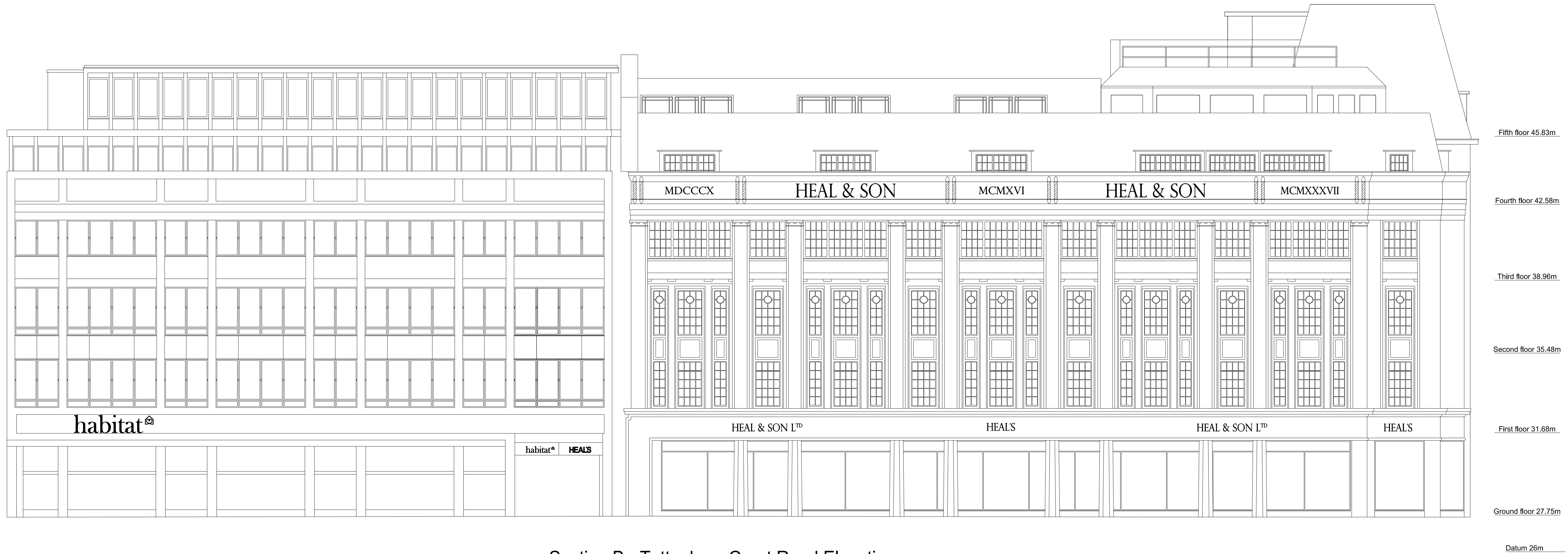
Section B - Tottenham Court Road Elevation