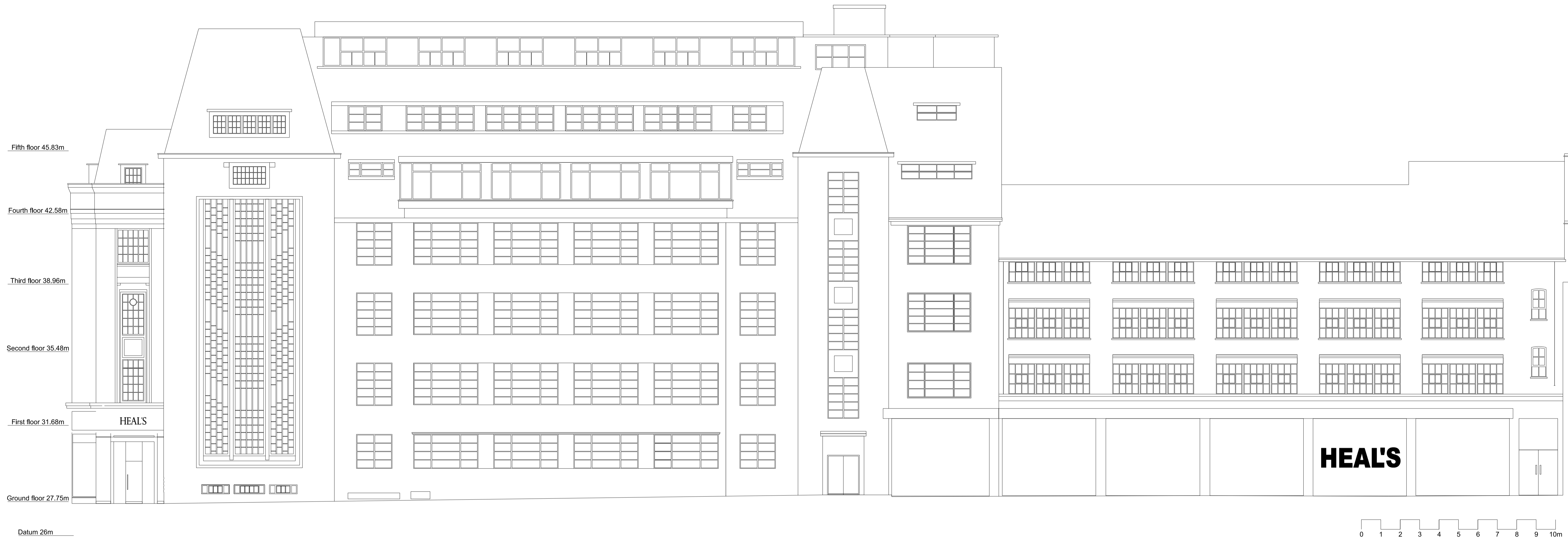
Section A - Alfred Mews Elevation