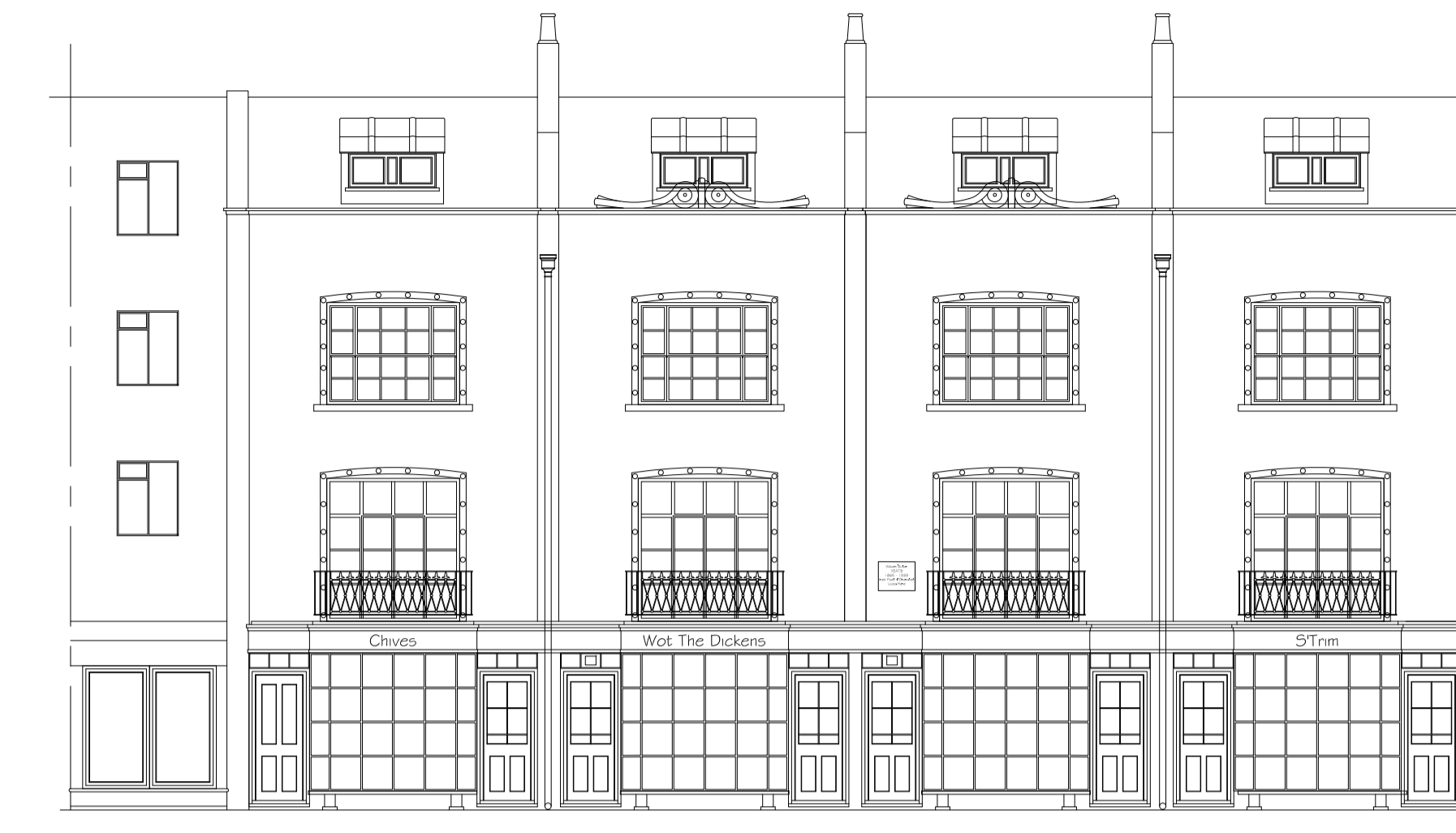
FRONT ELEVATION - AS EXISTING