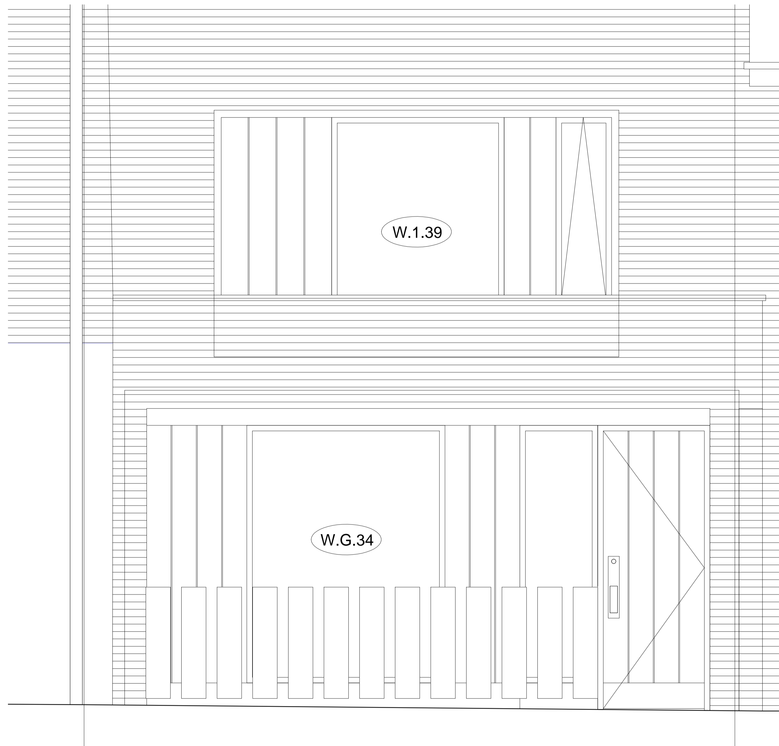
1 Unit A1 Entranceway and First Floor Elevation 1